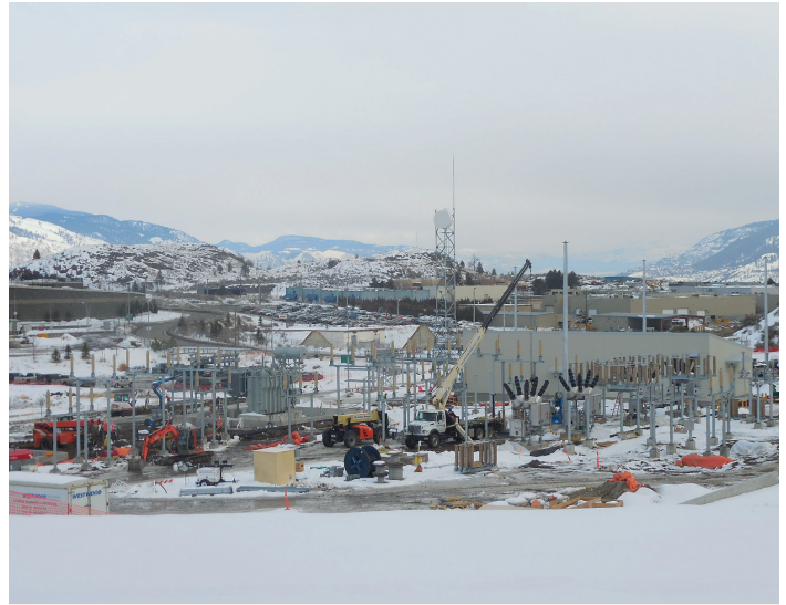
Overall site looking east

The communication tower has been erected and work continues on the electrical equipment and steel structures to support the power lines that will connect the substation to the electrical system.