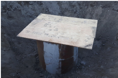
Steel pipe part of foundation for power line structure

To ensure your safety and that of our crews, avoid any fenced areas and please follow posted construction signs or directions provided by the on-site crews.