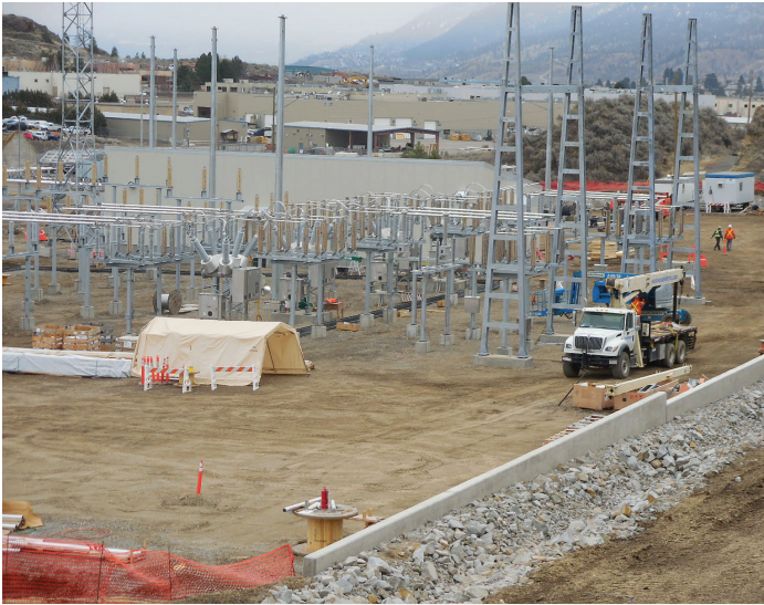
Steel structures looking east