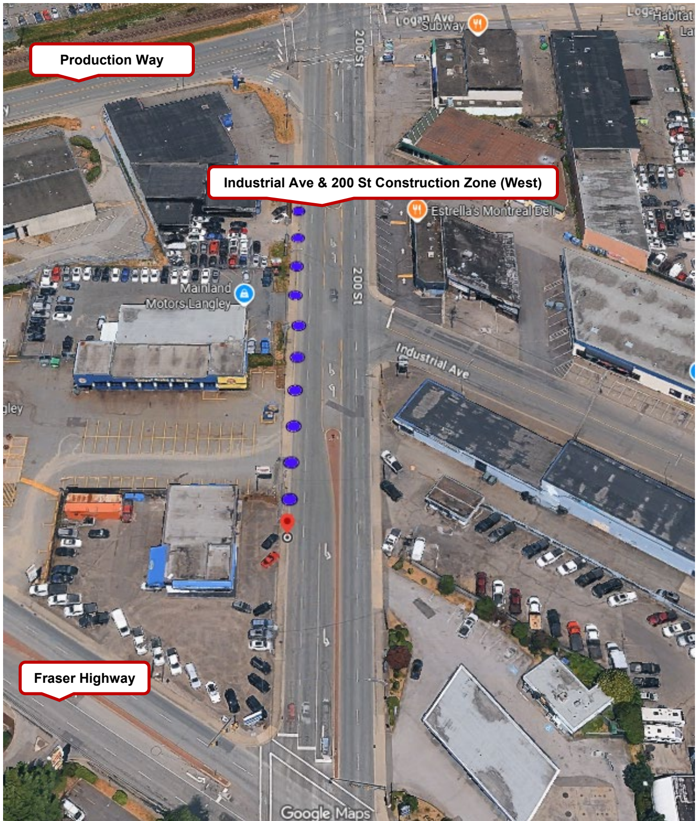
Above: Construction Zone (West) of Industrial Avenue and 200 Street, in Langley, is highlighted in blue.