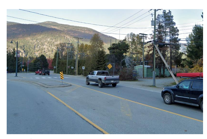
Viewfrom Pemberton Portage Road near Portage Road, looking north. Substation is to the right.