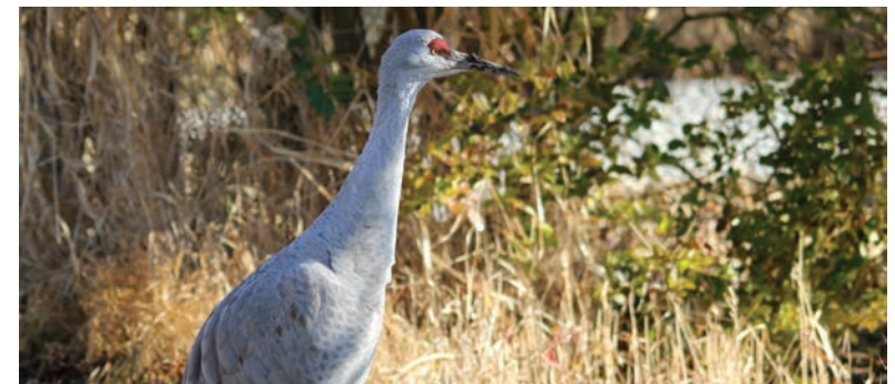
Crews protected the Sandhill crane during their nesting season by postponing work and minimizing the use of helicopters above their habitat.