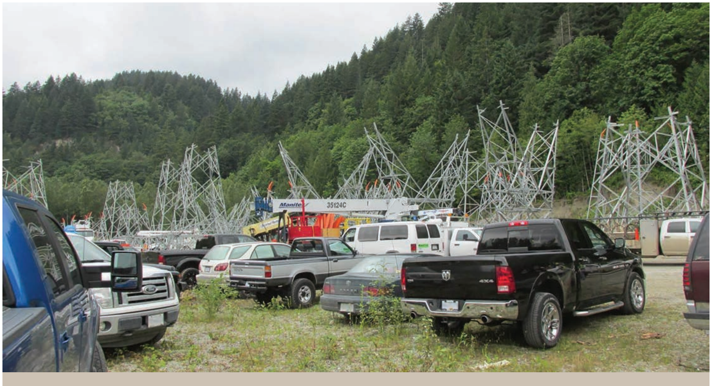
Crews assembled tower parts on the ground in one of the project's fly yards. Helicopters picked the parts up and flew them to site.