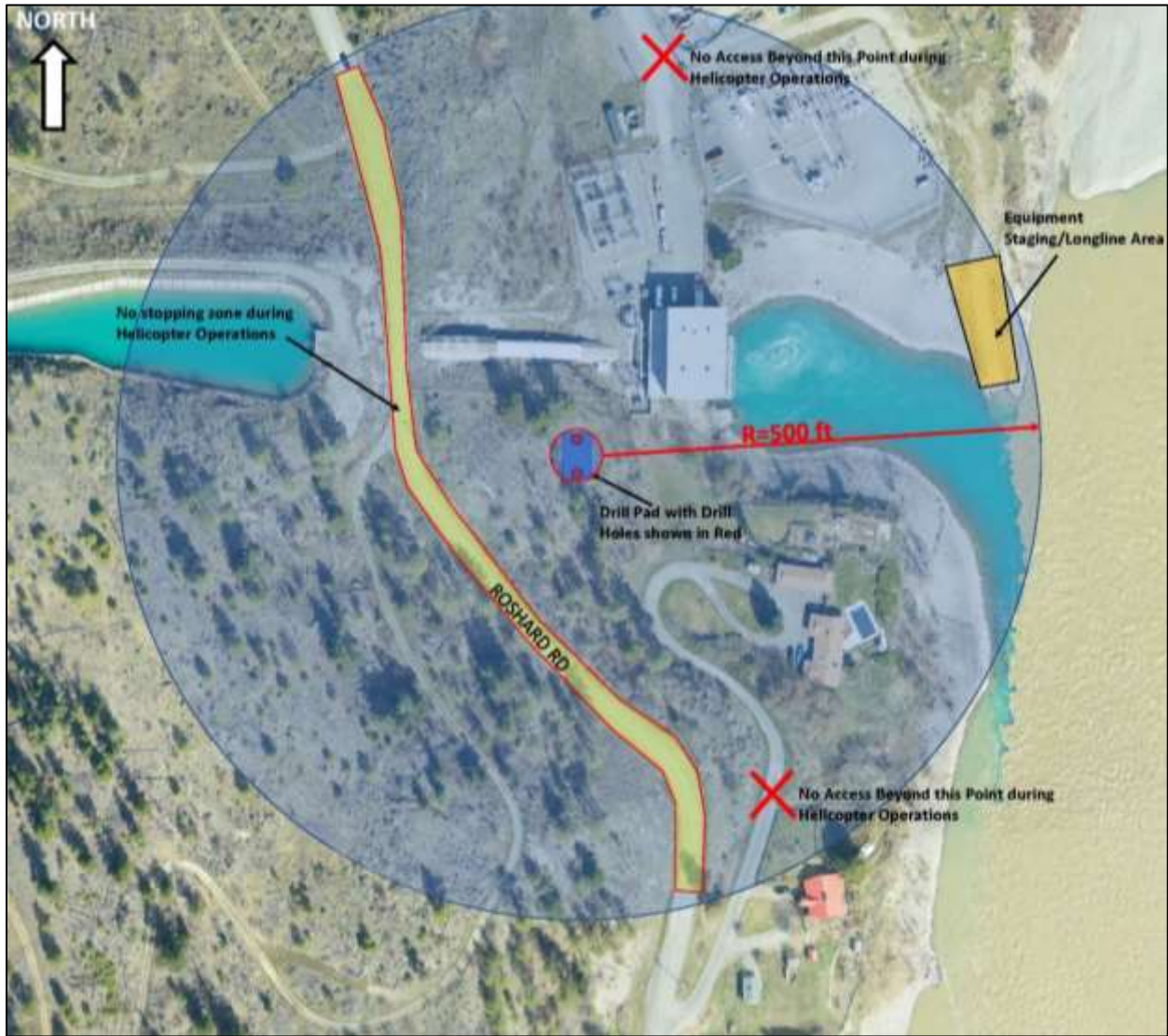
Figure 1 – Map Showing Drilling Locations, Staging Area, and No Stopping Zone