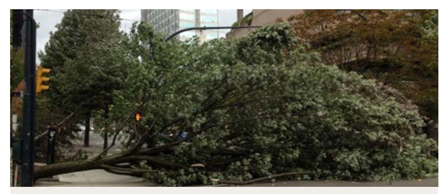
A tree knocked down by the wind on Nelson and Howe in Vancouver during the 2015 windstorm.

The conditions coming out of the summer months this year are slightly more severe than they were in 2015. Therefore, BC Hydro meteorologists warn that storm conditions could be especially challenging for areas such as the South Coast where there is a lot of vegetation that is not adjusted to the desert–like conditions.