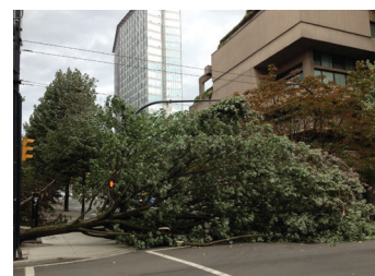
A tree near Nelson and Howe in Vancouver taken down by the August 2015 windstorm.

Not to be outdone, the Lower Mainland and Vancouver Island were also hit by an unusual late summer windstorm that same year that caused extensive damage to BC Hydro's system and knocked out power to more than 700,000 customers over a three day period. In the end, crews had the majority of customers restored within 72 hours – a huge effort which involved repairing over 10,000 metres of power line, 200 power poles and 1,200 pieces of electrical equipment. The August 2015 storm was the single largest outage event in BC Hydro's history.