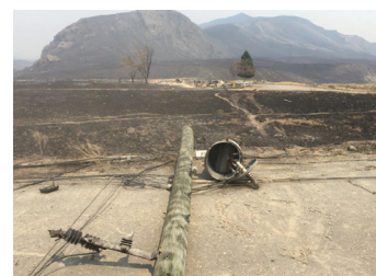
A power pole burned down by the 2017 wildfires.

The summer of 2017 was the largest wildfire season on record in the province. Significant wildfire activity in the Central and Southern Interior caused extensive damage to BC Hydro's infrastructure and impacted approximately 50,000 of its customers. Over the course of the summer, more than 100 BC Hydro and contractor crews worked to repair 475 power poles and 377 spans of wire.