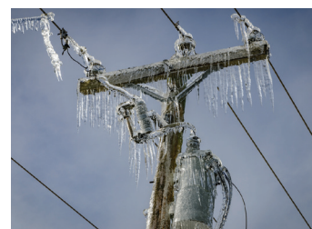
A power pole encased with ice as a result of the 2017 ice storm.

During the last weekend of December in 2017, an unprecedented ice storm hit the Fraser Valley. The freezing rain and cold temperatures caused ice to form on trees causing them to break and fall on to power lines and knock down power poles. In other cases, BC Hydro equipment – power lines, poles and equipment at a substation – became encased with ice, leading to outages. Over the course of the three day event, the storm caused 142,000 power outages and damaged: over 50 power poles and 391 spans of wire. The poor weather conditions and icy roads made for an extremely challenging response for BC Hydro crews who had to pare back work at times to ensure their own safety. Despite this, crews managed to restore power to 75 per cent of affected customers within 24 hours.