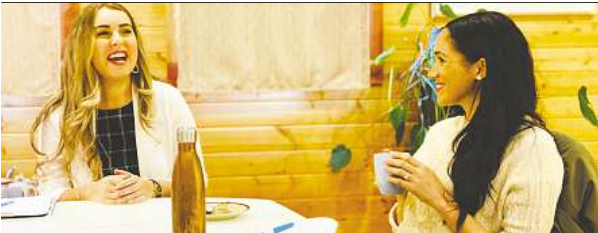
Prince Harry and Meghan Markle, right, pictured visiting a women’s shelter in the city this week, could become the latest wealthy couple to flock to the so-called “gateway city” of Vancouver.