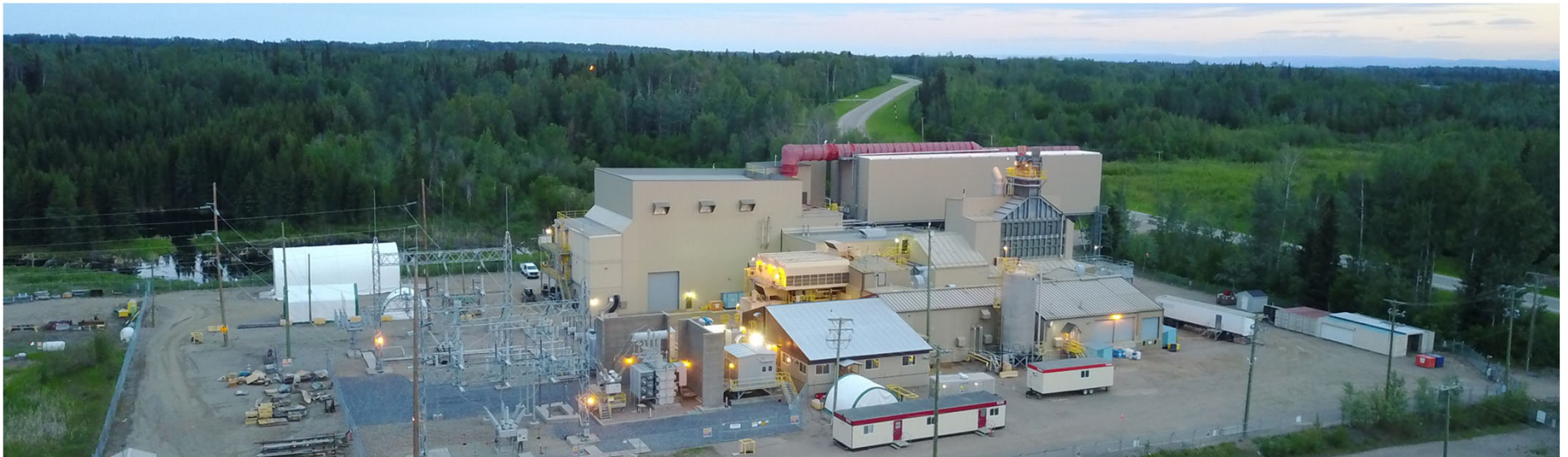
Fort Nelson Generating Station

Public Community Session & Meetings – April 2024