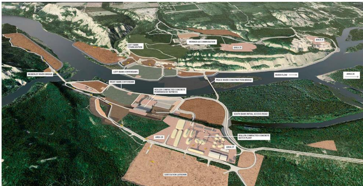
Figure 3 Map of Main Civil Works work Areas

Construction progress at site currently is split between work on the left bank and right bank.