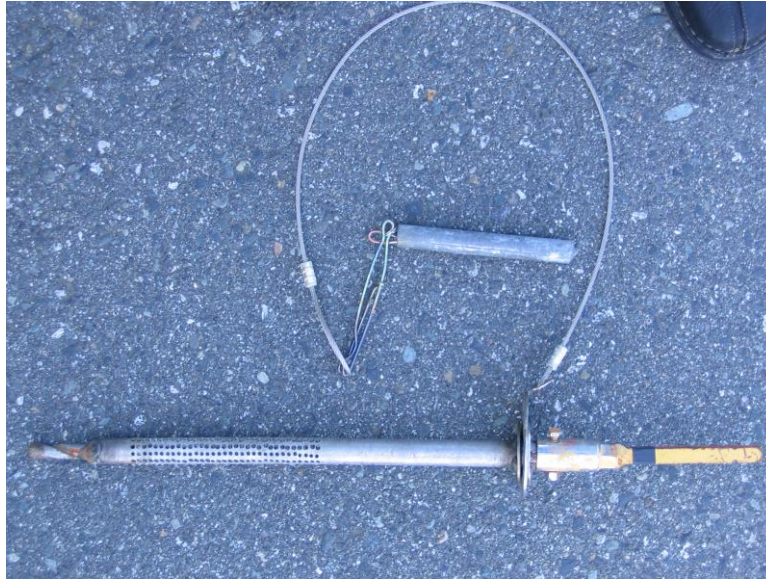
Figure 3.2 Specially constructed "tube" incubator, with anchor pin, ceramic drill bit head, and auger attachment.

At the end of the experiment eggs will be removed from each device, their condition assessed (dead or alive (sub-categories: hatched, dead alevin, live alevin). Incubation success will be calculated independently for each replicate by scoring the number of eggs that are alive or dead within each incubation device as well as the stage of development. If results of the study indicate that incubation success is not simply binary (i.e., dead or alive) it may be necessary to develop a scale by which development is measured (e.g., normal, slightly delayed, substantially delayed, dead).