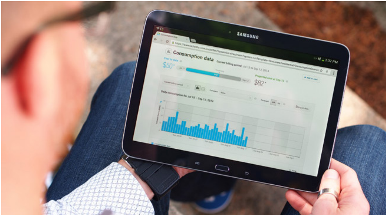
Electronic billing reduces paper consumption.

We continue to have one of the highest rates of paperless billing among those utilities surveyed by the Canadian Electricity Association. This adoption rate is facilitated by our efforts to make it easier for customers to pay their bills via the option of detailed email bill notifications including the amount owing, due date and electricity usage.