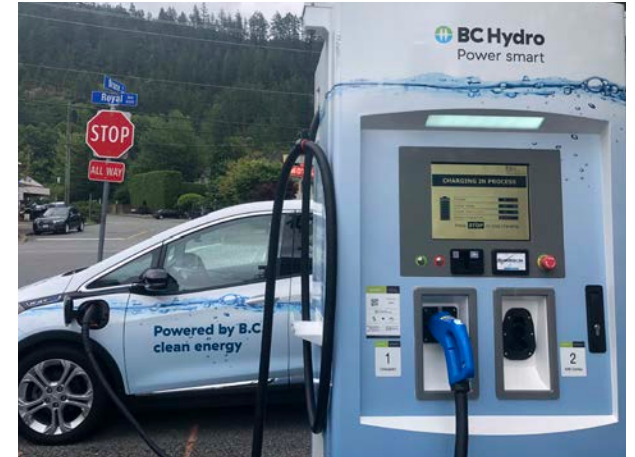
Chevrolet Bolt vehicle charging