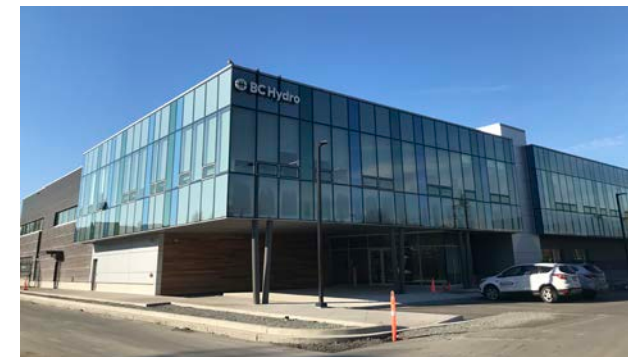
Victoria District Office