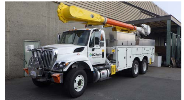
Heavy Hybrid Truck front view