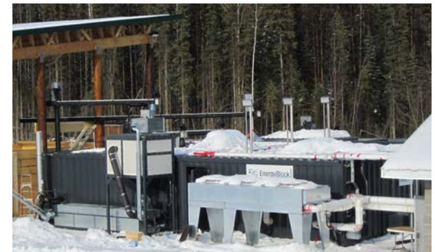
Biomass Plant at Kwadacha