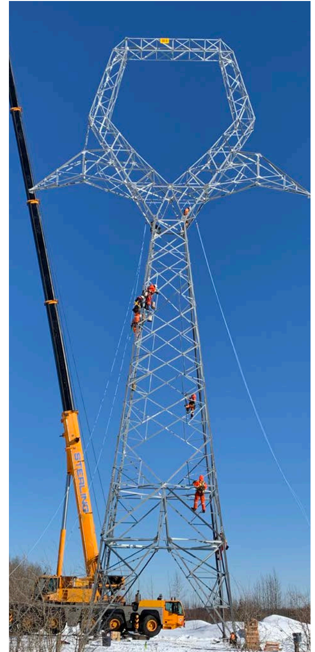
Upgraded Transmission Lines withstand icestorms

After the 1998 ice storm in Eastern Canada and US, BC Hydro assessed the transmission network and began to upgrade 230kV and 500kV transmission lines to withstand 1-in-200 year return period ice loadings. The newly constructed lines were designed using reliability based design principles to withstand 1-in-200 and 1-in-100 year return period weather loadings, respectively. Similarly, 500kV and 230kV transmission lines under construction have been designed to withstand 1-in-200 and 1-in-100 year return period weather loadings.