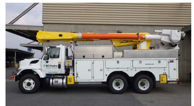
Heavy Hybrid Truck side view