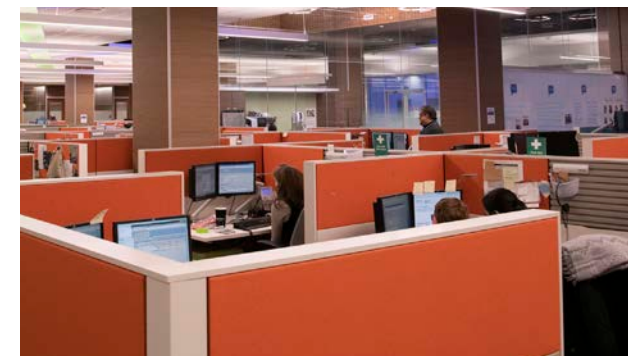
Renovations at Hamilton Centre