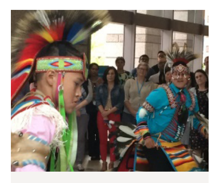
Indigenous dancers at BC Hydro's National Indigenous Peoples Day celebrations

Articles 4, 18, 19, 23, 32, 33, 34, 35 and 40