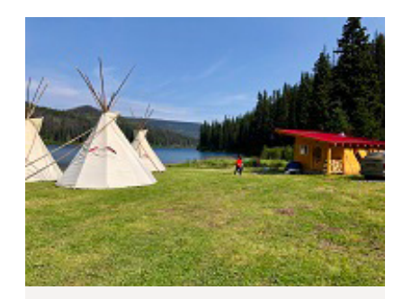
Saulteau First Nations culture camp

Articles 3, 8, 11, 12, 13, 14, 15, 16 and 24