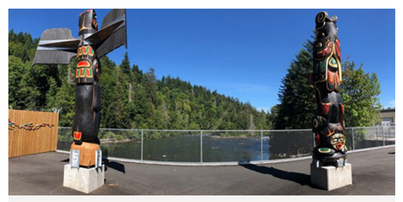
Two totems were installed at the John Hart generating station to mark our relationship progress with We Wai Kai and Wei Wai Kum

The remaining sections of this plan outline how these five themes relate to the UN Declaration (and include references to the articles in the UN Declaration which we have drawn from), set out BC Hydro's focus areas within each theme, and identify the actions BC Hydro is taking in collaboration with First Nations and Indigenous peoples. In considering which of the plan's actions apply to First Nations and which may apply to Indigenous peoples more broadly, BC Hydro is guided by the Province's distinctions–based approach.