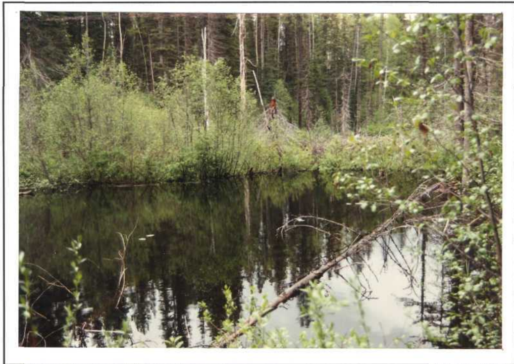
Plate 1: View of outlet looking downstream, approximately 150 m downstream from lake. The outlet to this point from the lake is a series of beaver dams and resulting ponds, with no fisheries enhancement potential.