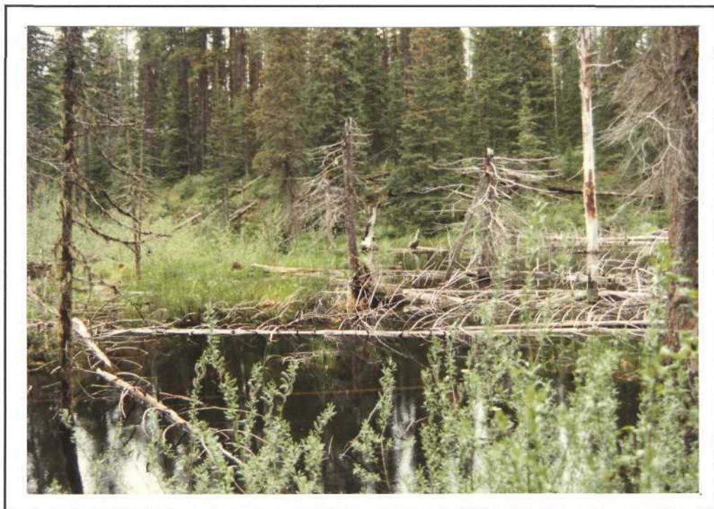
Plate 2: View across outlet at beaver pond and drowned trees, approximately 150 m downstream from lake.