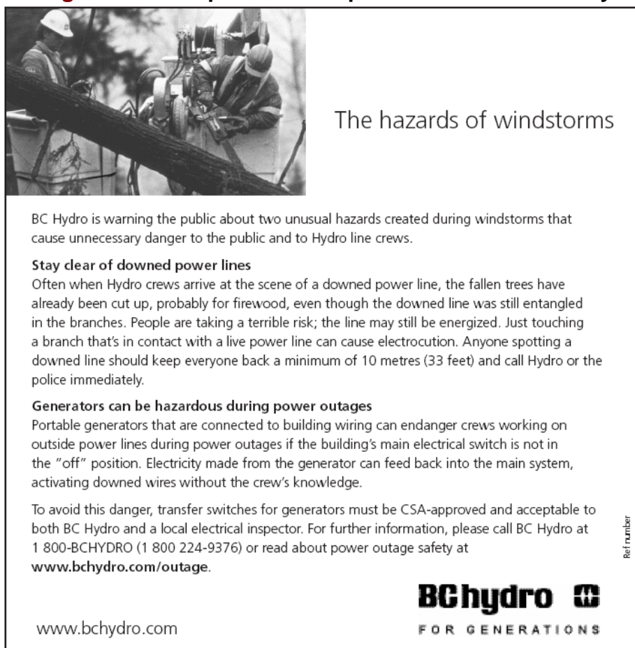
Figure 1: Example of a newsprint ad for Public Safety

Educating the public on the dangers associated with downed power lines is valuable and should continue to a pre-emptive measure to enhance public safety. BC Hydro has included public safety messaging in bill inserts to residential customers and sent out a similar insert to commercial/industrial customers (see Appendix E). These inserts highlight the need to prepare for outages: to use home generators appropriately in order to reduce the risk of carbon monoxide fatalities and back-feeding into the electrical distribution system; to stay clear from downed power lines; and, to use appropriate contact numbers (e.g. BC Hydro's 1-888-POWERON call system described in next section). In addition, newspaper and radio ads have been used in the case of short notice. An example of an ad from 2007 (with old contact numbers) is presented below.