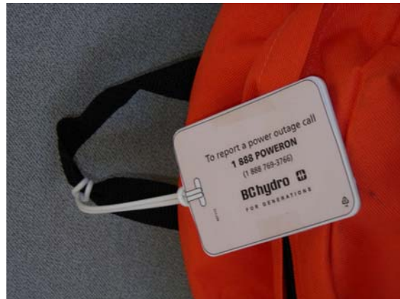
POWERON Luggage Tags on Emergency Response Kits

The kits contained emergency supplies for 72 hours including a postcard provided by BC Hydro with power outage and public safety tips as well as luggage tags with the POWER ON telephone number.