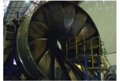
Units 1-5 Turbine Rehabilitation Project - above is the Runner for the first turbine unit during fabrication in Brazil.

Meeting current and future demand for electricity in B.C. is the foundation of our planning activities. We are now forecasting that the province's electricity needs will grow by as much as 40 per cent over the next 20 years, due to industrial activity, general economic and population growth, and electrification. It is critical that BC Hydro undertakes capital work to renew and upgrade hydroelectric infrastructure at several facilities.