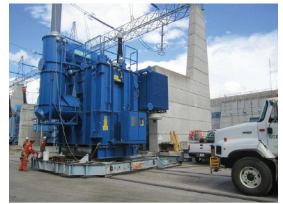
Phase A Transformer being pulled onto the installation pad after the oiling process.

The Peace Canyon Dam and Generating Station (PCN) was completed in 1980. It is located at Hudson's Hope, 23 km downstream of the WAC Bennett Dam. The facility has four generating units producing a maximum capacity of 694 megawatts, using the same amount of water as GMS. The project will see the replacement of one of the large power transformers in the spring of 2012. The old unit will then be turned into a spare unit for PCN. The work is necessary because of a transformer failure in fall 2010.