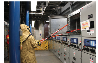
Dressed in protective suits, electricians are confirming voltage levels (phase and rotation) across an electrical breaker at GMS. Through these Station Service Panels, power is provided to the GMS Powerhouse.