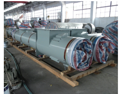
The iso-phase bus duct in China being prepared for shipment to GMS. This is part of the Capacity Increase project.