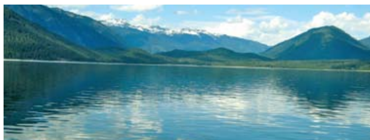
Arrow Lakes Reservoir.

The maximum and minimum licensed levels for Arrow Lakes Reservoir are 440.1 m [1444 ft.] and 420.0 m [1378 ft.] respectively.