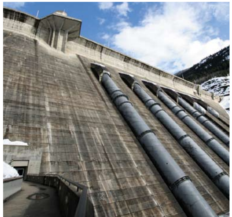
Revelstoke Generating Station.

The maximum and minimum licensed levels for Kinbasket Reservoir are 754.4 m (2475 ft) and 707.1 m (2320 ft) respectively.