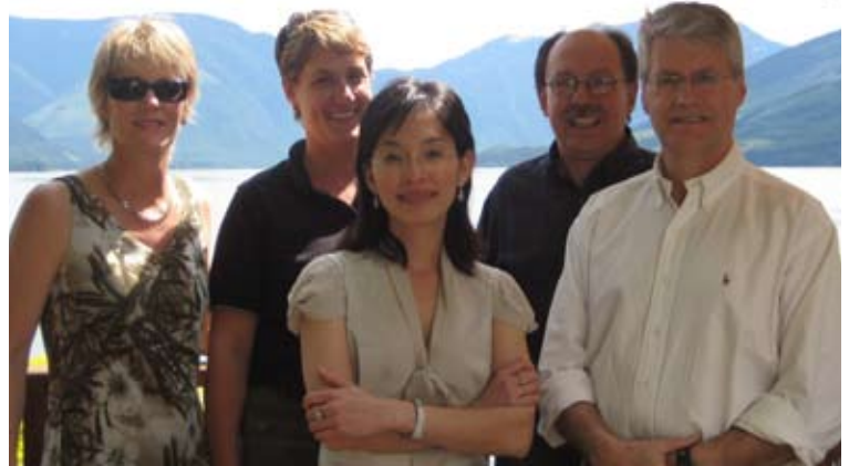
BC Hydro Operational Update team in Nakusp.

Website: www.fortisbc.com Phone: 1 866 436 7847