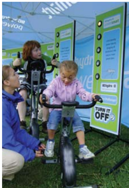
RIGHT: Giving a helping hand during the Turn It Off Tour bicycle challenge in Oyama, B.C.