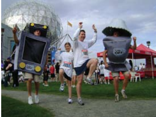
ABOVE: Warming up at the PMC Sierra Fun Run in Vancouver, B.C.

In addition, our roving community cruisers coasted up and down B.C.'s roads and highways and stopped wherever people gather to spread the message to more than 200,000 people about the need to be green.