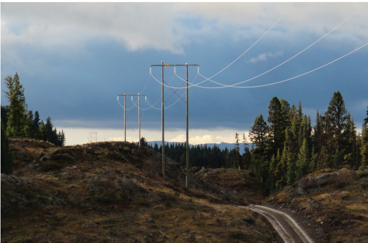
A completed section of the new 138-kilovolt transmission line.

To ensure reliability is maintained until the MAT project is completed, BC Hydro is keeping a back-up mobile transformer at the Merritt Substation with a second mobile transformer in close proximity.