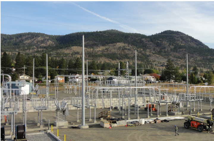
A view of the upgraded Merritt Substation outdoor yard.