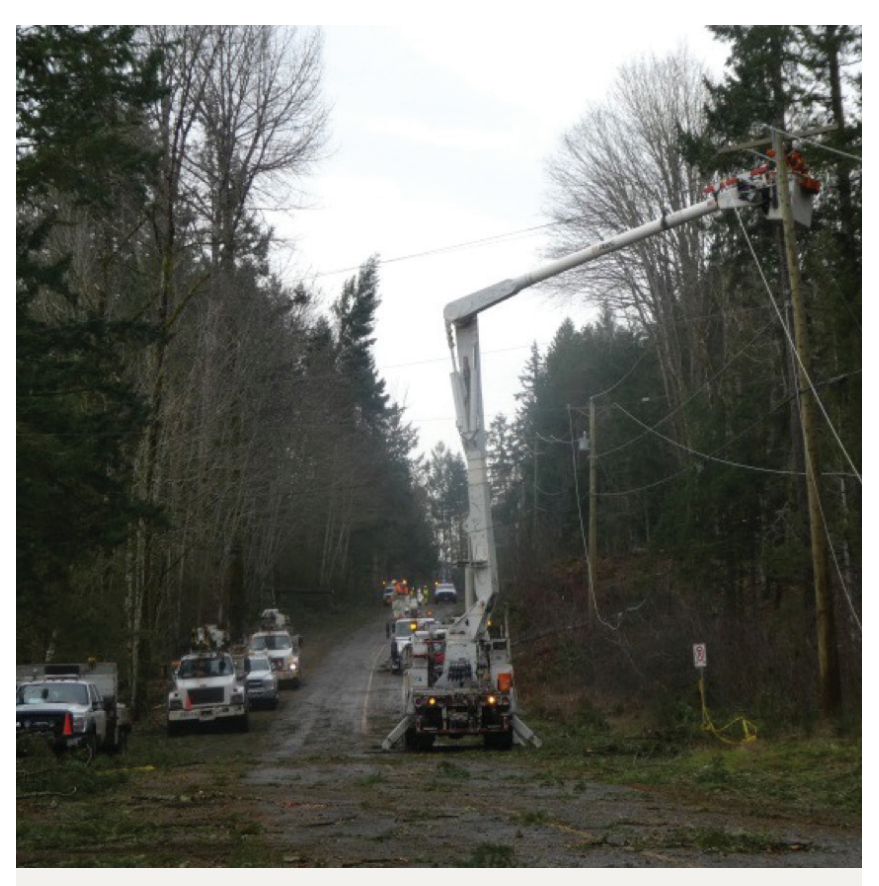
Crews repairing extensive damage in Nanaimo following the December 2018 windstorm, the most destructive in BC Hydro's history.

Storm season traditionally stretches from November to March; however, there is a trend of storms now beginning earlier in the fall and extending later into the spring. Extreme weather such as heat waves and drought are also becoming more common in the warmer months. With near record-breaking drought this summer and early fall, there is an elevated risk of more weather-related power outages caused by dead or damaged trees and vegetation contacting electrical infrastructure this storm season.