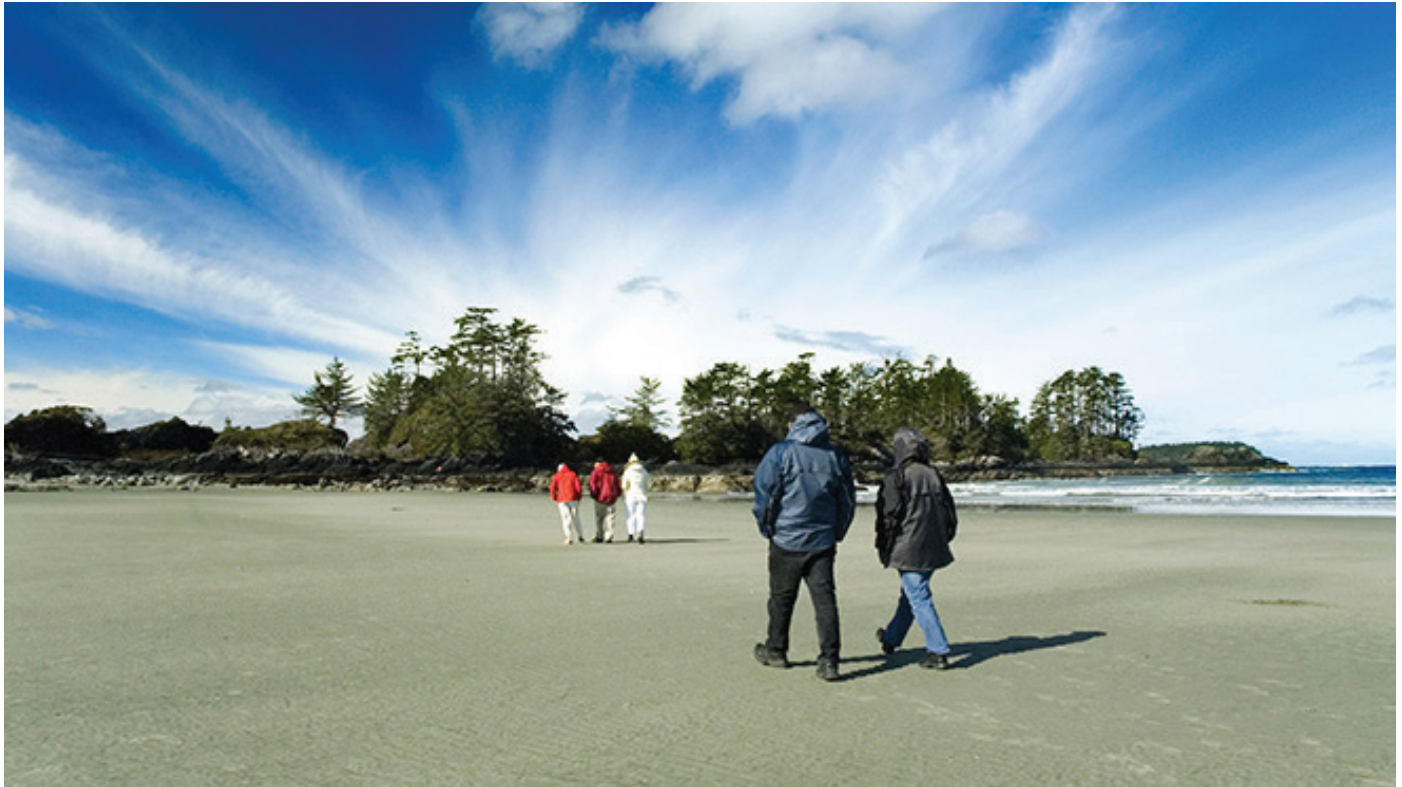
Walking Tofino's beaches at low tide is the highlight for some. For others, it's surfing, storm watching or fishing. No. 87 on our list of great places in B.C.