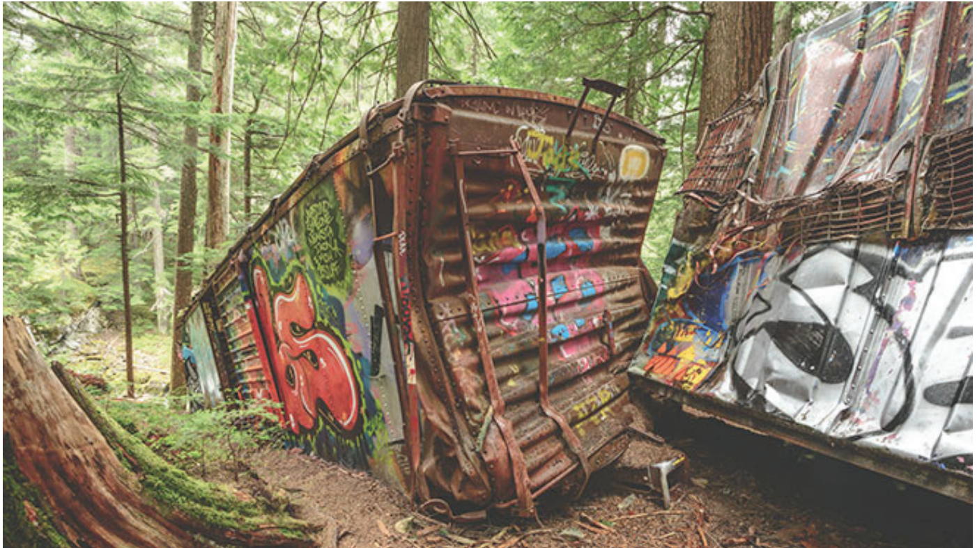
A short hike on a Whistler trail takes you to graffitied boxcars strewn throughout the forest. No. 120 on our list of great places in B.C.