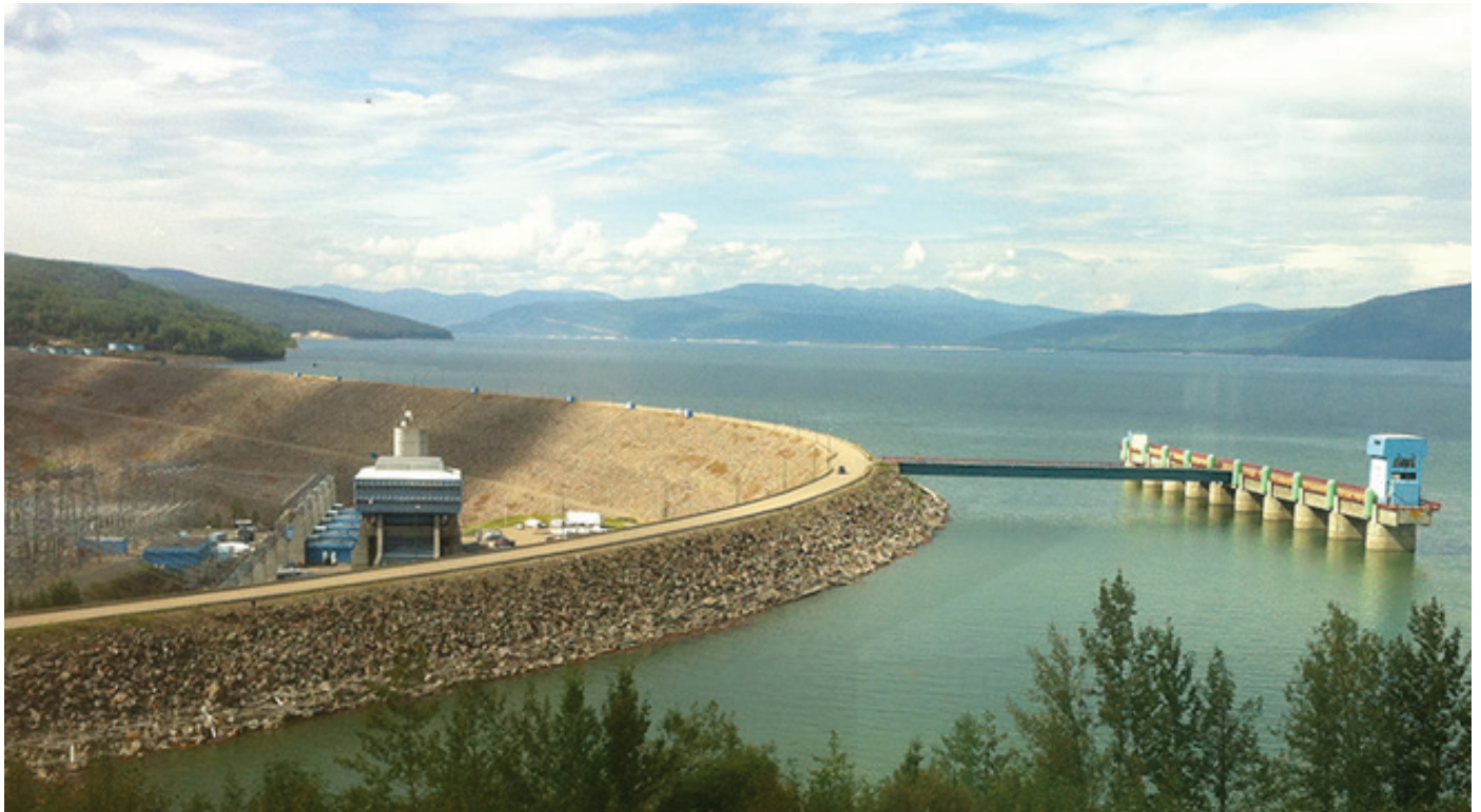
A view of W.A.C. Bennett Dam and Williston Reservoir from the BC Hydro visitor centre. No. 13 on our list of great places in B.C.

How can you not like a place that holds acoustic open mic night on a stage with a Stanley Cup playoff game running behind the musicians? Or a “take your requests” piano duo named Burn N Mahn? Check out The Lido's events here.