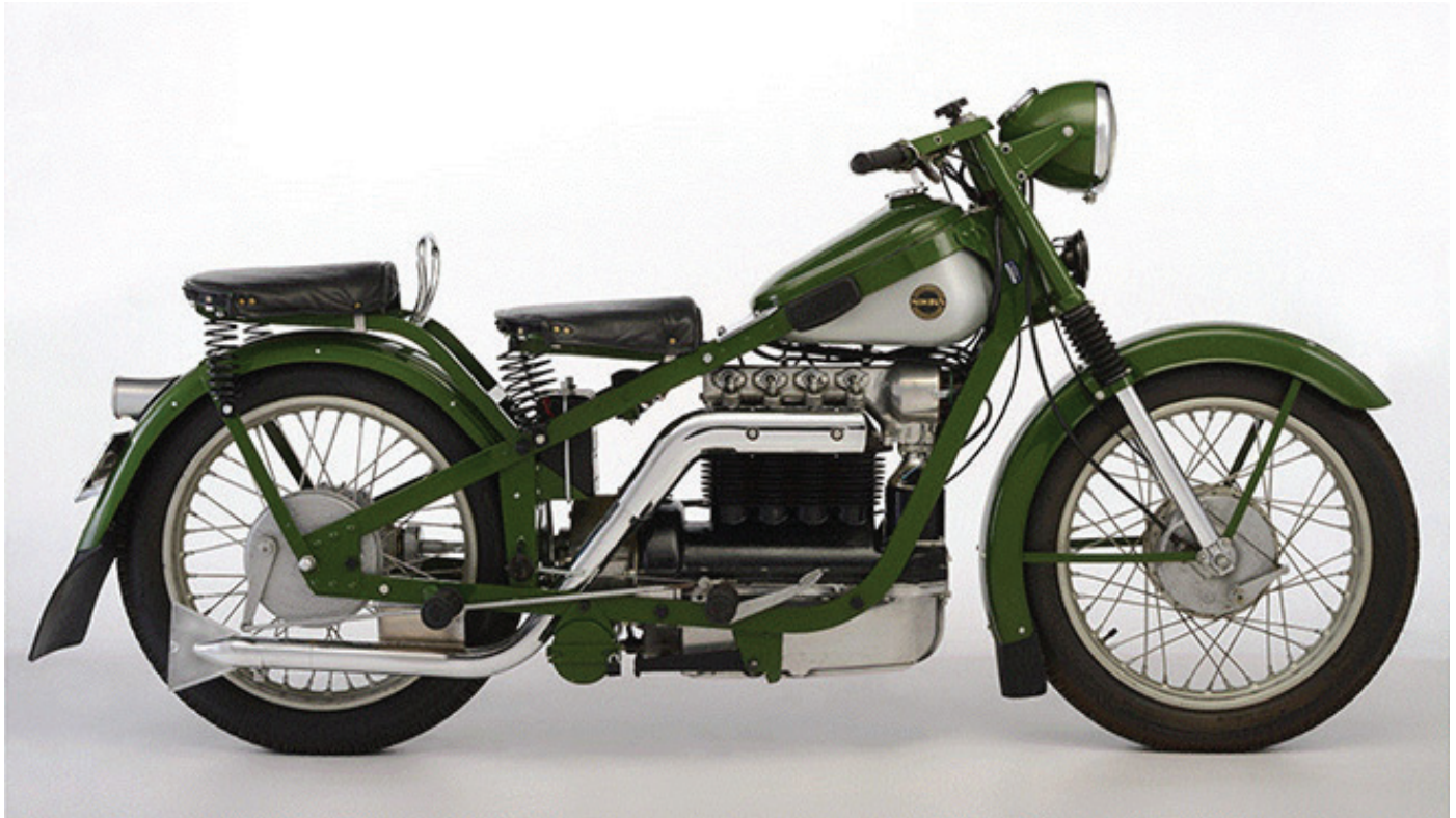
Motorcycles from around the world are showcased at the Deeley Exhibition in East Vancouver. No. 139 on our list of great places in B.C.