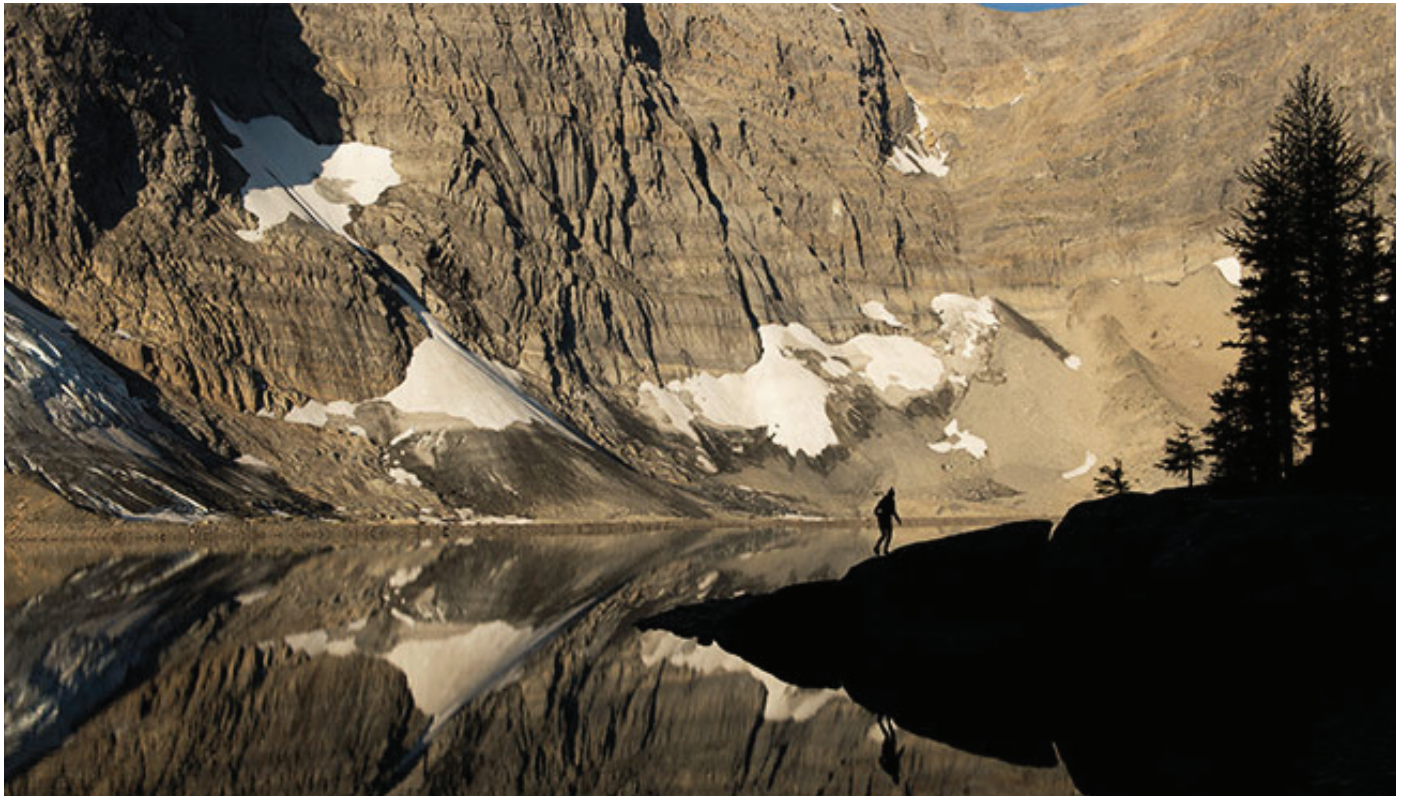
Hiking in the Rockies can be spectacular, taking you to places such as Floe Lake (pictured here) or Marble Canyon (No. 29 on our list) in Kootenay National Park.