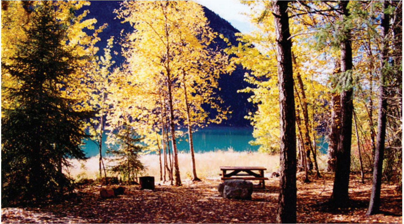
Gun Creek recreation site in BC Hydro's Bridge River system. No. 128–129 on our list of great places in B.C.