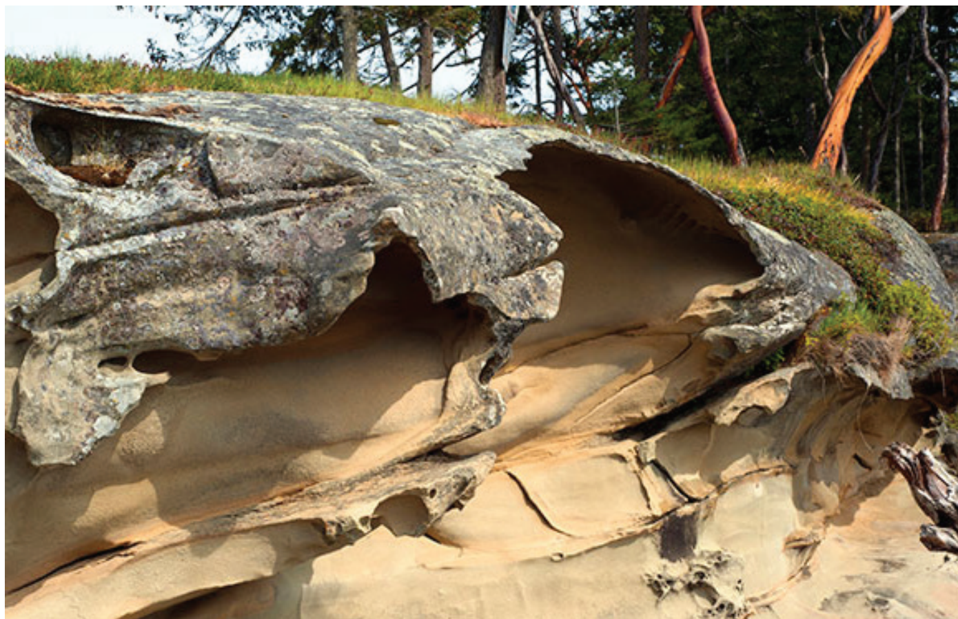
The wave-like sandstone formations along the beach on Gabriola Island, known as the Malaspina Galleries, are No. 114 on our list.

You can't go wrong with a place that serves up otherworldly cheese, chutneys, and olives on what one visitor described as "a quaint farm filled with surprises." The Salt Spring Cheese Company's cheeses, such as the Ruckles goat milk cheese, aren't just delicious, they're works of art.