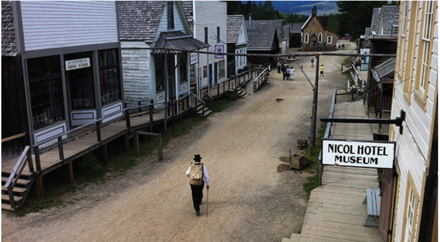
The wild west has never died in Barkerville, No. 6 on our list of great places in B.C.