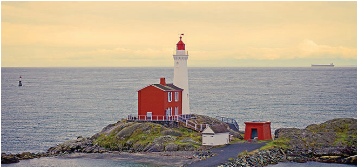
Fort Rodd Hill and Fisgard Lighthouse National Historic Site, near Colwood, offers deep dive into history, and some real cool photo opportunities. No. 104 on our list of great places in B.C.