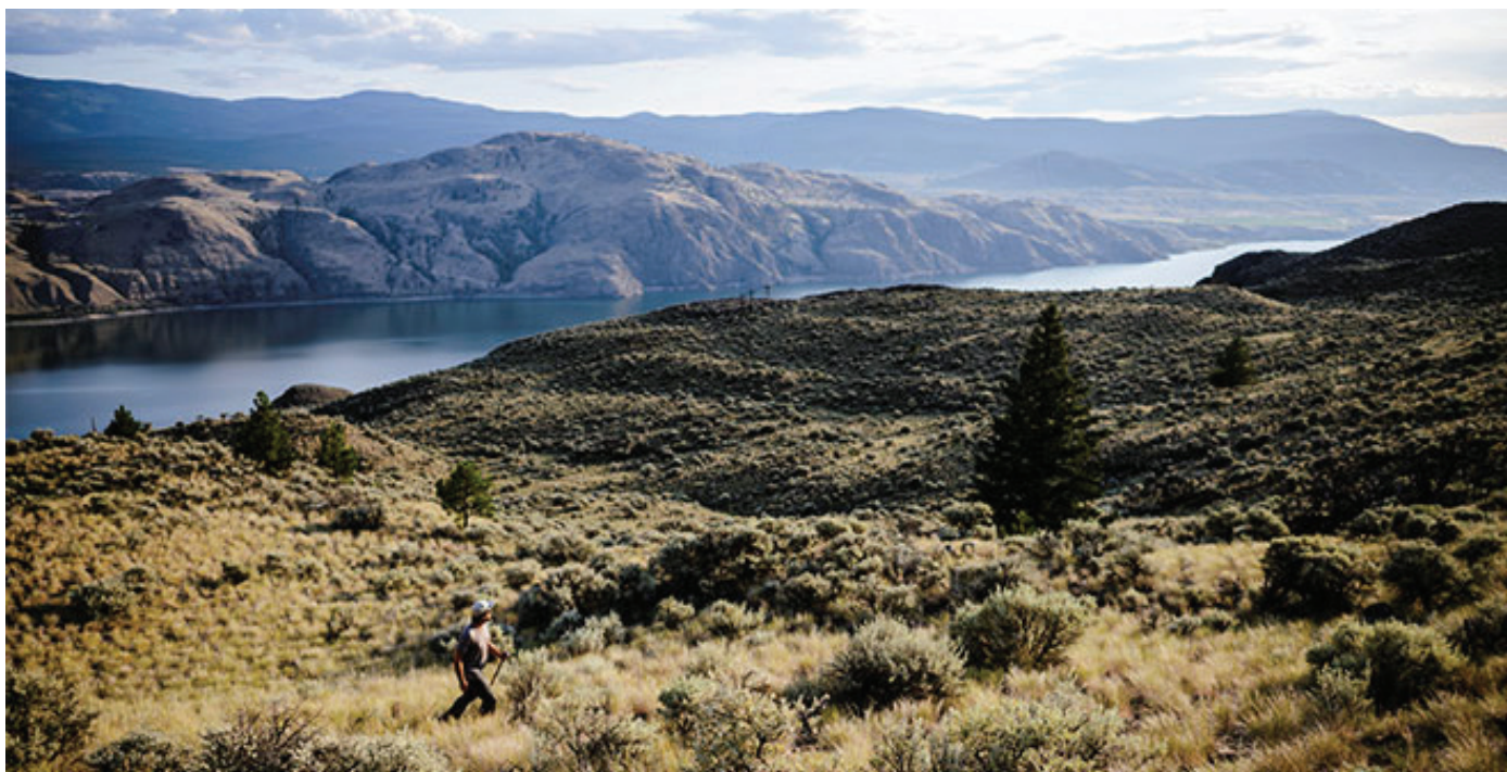
A short drive from Kamloops takes you to the Lac Du Bois grasslands and hiking/biking trails that afford views out over Kamloops Lake. No. 49 on our list of great places in B.C.

A grasslands protected area featuring cliffs, canyons, ponds and lakes, Lac Du Bois is a bit of a local secret at which you can find yourself pretty much alone, just a short drive from Kamloops. And if you're a beginning to intermediate mountain biker, you may want to take advantage of the trail network here .