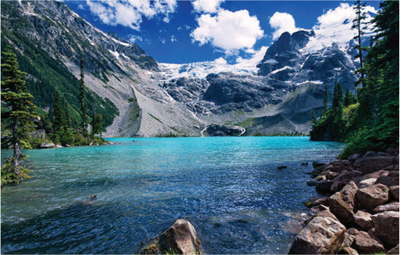
Joffre Lakes hike, near Pemberton, is No. 126 on our list.