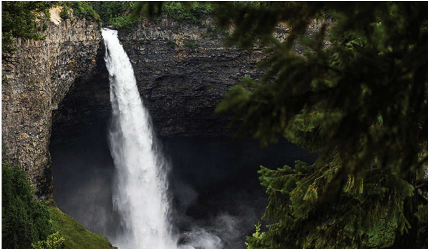
Helmacken Falls at Wells Gray Provincial Park, north of Kamloops. No. 43 on our list of great places in B.C.