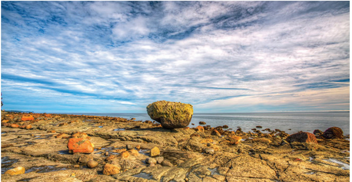
Balance Rock near Skidegate (No. 24 on our list) doesn't defy physics, but it sure looks that way.

Some may debate whether it's the world's tallest, but at 173 feet tall, the wooden tribal totem at Alert Bay is impressive, especially when viewed from near its base, such in this fantastic shot from photographer David Niddrie . The Village of Alert Bay is a discovery in itself, and was recently featured in our BC Hydro newsletter for its assortment of solar roofs on village buildings .