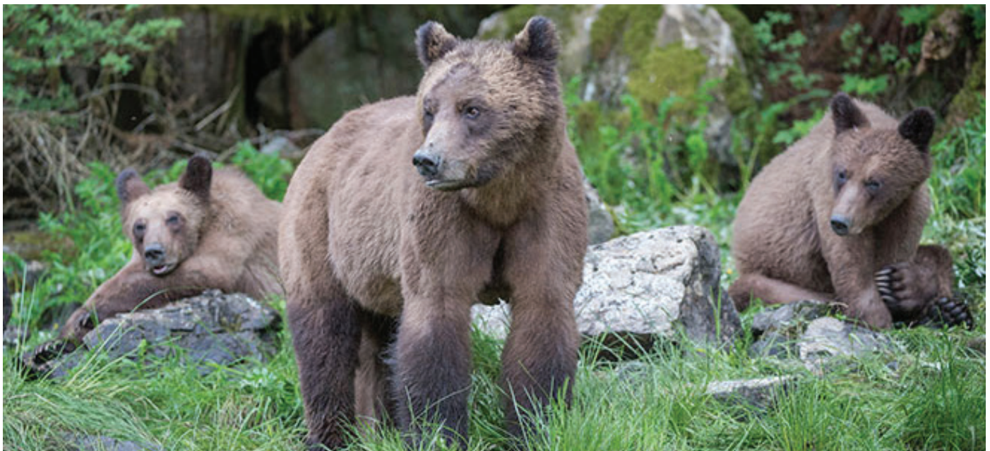
A grizzly bear family at Khutzeymateen Grizzly Bear Sanctuary north of Prince Rupert. No. 19 on our list of great places in B.C.

Tour boats take you into remote country northeast of Prince Rupert for an unforgettable tour, where the protected bears thrive. You may see a single bear, or you may see many. But the multi–hour trip to Khutzeymateen Grizzly Bear Sanctuary is so scenic, it won't really matter.