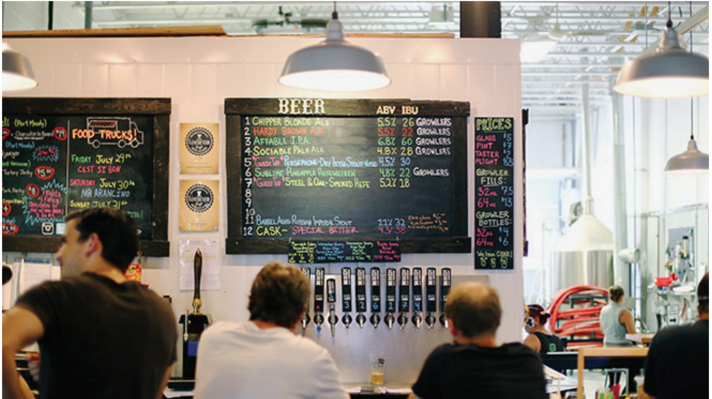
Want a craft beer. Brewer's Row at Rocky Point Park in Port Moody offers four tasting rooms over three blocks. No. 138 on our list of great places in B.C.