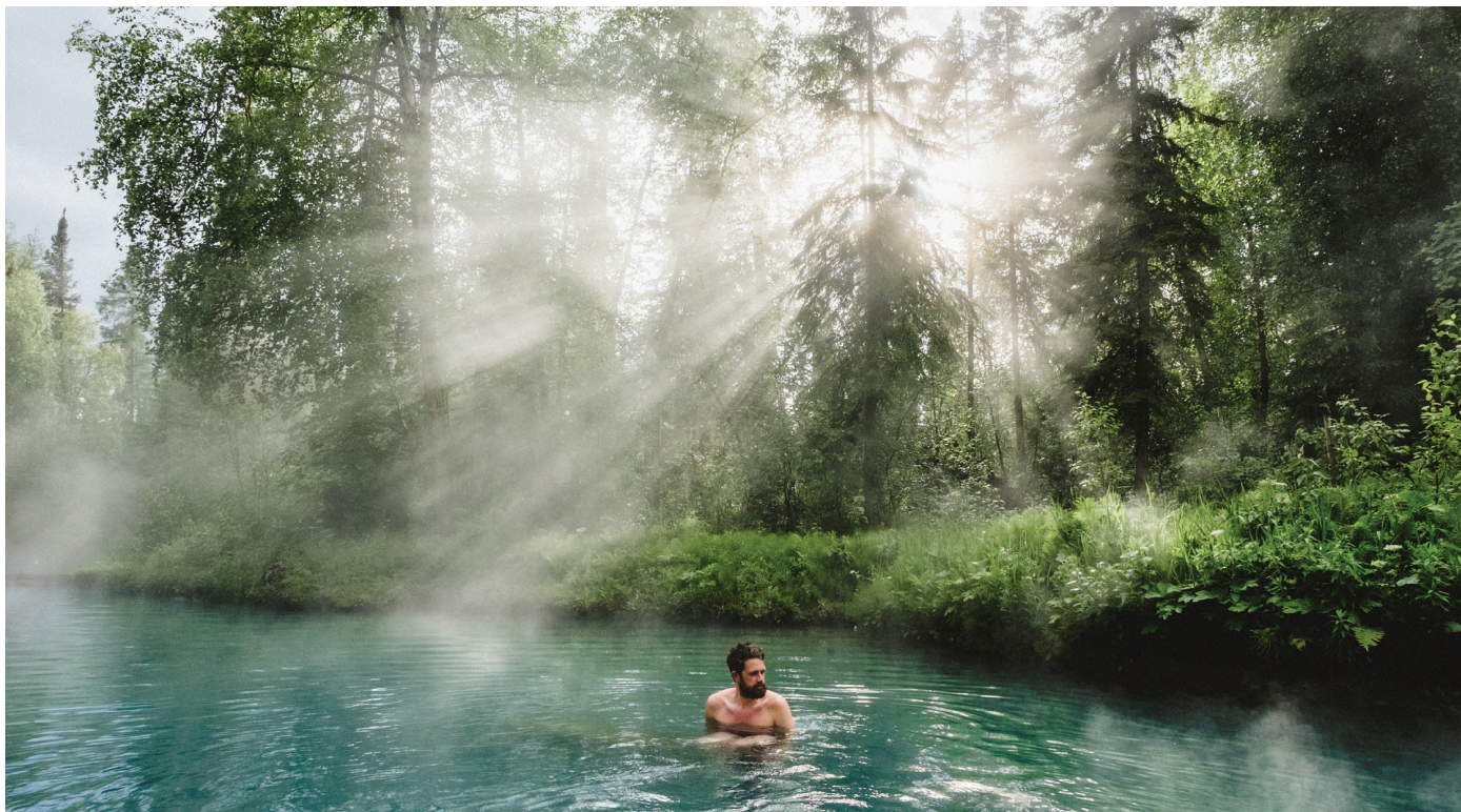
Liard River Hot Springs. No. 8 on our list of great places in B.C.

You can plan for an African safari, or you can embark on a made-in-B.C. equivalent at Tweedsmuir Park Lodge , where options include watching grizzlies feast on spawning salmon in the fall, or fly fishing and heli-skiing on the same day.