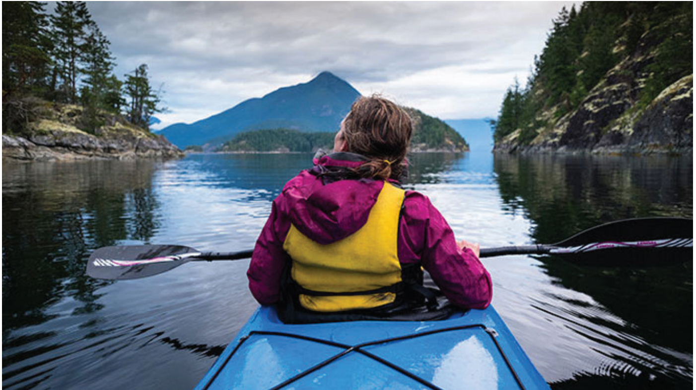
A kayaker paddles over glassy waters in Desolation Sound, B.C. No. 112 on our list of great places in B.C.