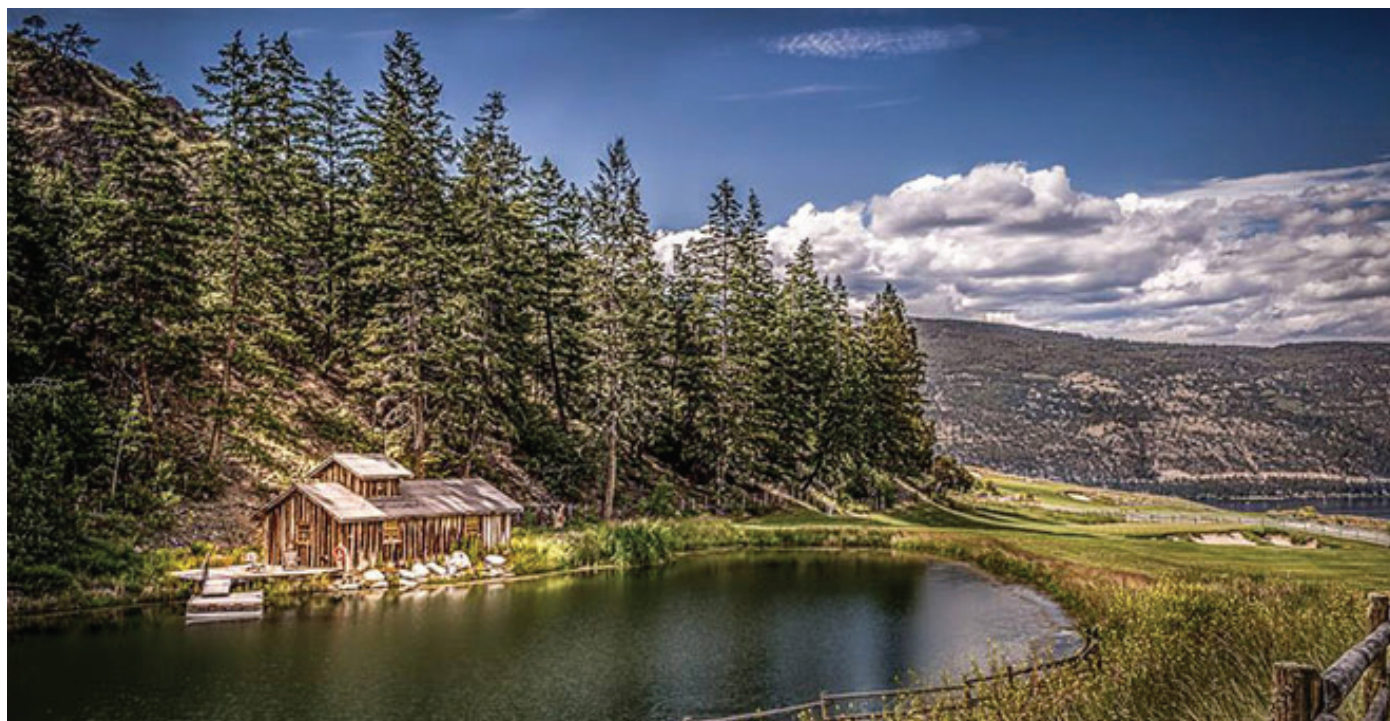
Right by the 13th hole at Sagebrush Golf Club near Merritt, there's a trout-stocked lake you can stop to fly fish in. And there's dinner, too.

By no means the only outstanding courses in the area, Tobiano and Sagebrush rank as destination links rated 13th and 10th, respectively, on ScoreGolf's Top 100-rated courses in Canada. When Sagebrush reopens to the public (possibly this summer) you'll even be able to fly fish (and have a dinner) alongside the 13th hole.