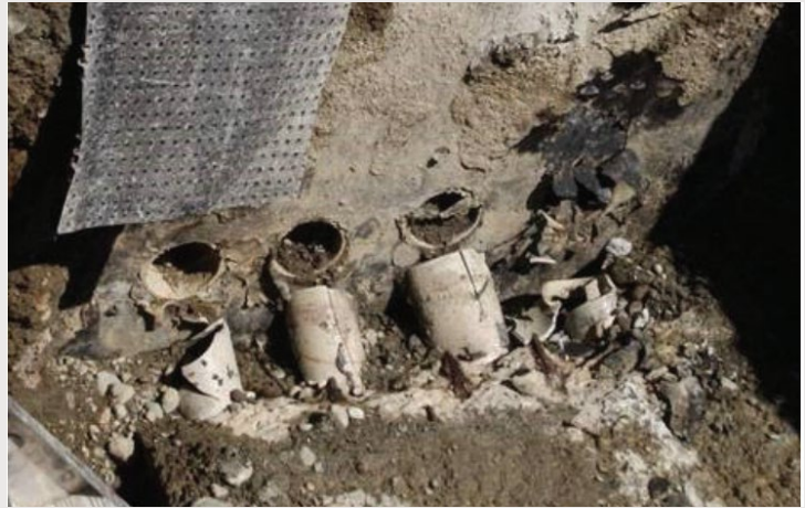
Figure 1 – Service ducts sheared due to differential settlement.

All civil work and structures required for underground service connections on private property are owned and maintained by the Customer. This includes service ducts. If designed incorrectly, service ducts may shear due to a differential settlement between the building perimeter and the building foundation (See Figure 1 – Service ducts sheared due to differential settlement ).