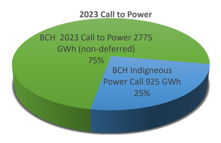
Figure 2 BC Hydro Indigenous Power Call for 925 GWh proportionate to the 2775 GWh