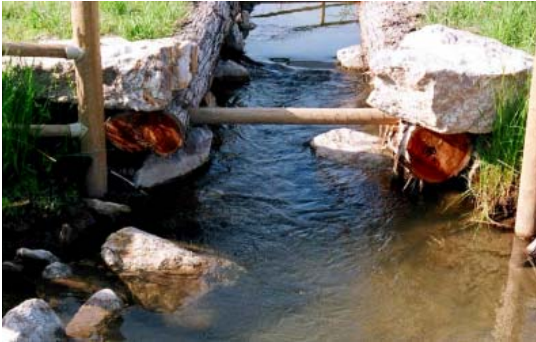
Figure 24: This photo taken in mid-June shows the water flowing out of the sediment pond on the Hahn property. At the time, the river was high and the water turbid, with visibility to a depth of 30 cm. The intake valve is closed. The water flowing out of the pond is largely groundwater and clear with the infiltration gallery accounts for most of the flow. There is also infiltration from the sides of the pond.

depending on the groundwater level. When river water is shut off, the infiltration gallery still supplies a clean flow, approximately 2 ft 3 /s (Figure 24).