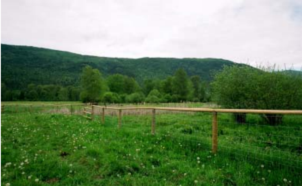
Figure 21: On some sections of the page wire fence, rails were added. The top of the wire was lowered and the bottom of the wire was raised to allow passage of wildlife such as fawns and bears.

The Chambers and limited company properties both are used for pasturing cattle and barbed wire was used. On both properties the Hesketh method of bracing was used. This is a 3-post brace with a brace placed at the end of every section of wire (Figure 22).