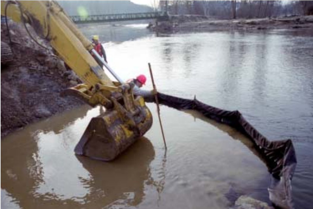
Figure 14: The elevation is checked for the placement of the intake structure. Note the silty water on the inside of the curtain compared to the clear river water. The dirty water was drained down the pipeline during construction. Because the cold water would quickly incapacitate anyone who fell in, all the workers wore floatation jackets.

The intake was placed after the trench was dug to the proper elevation (Figure 14). Two chains attached to the intake allowed the two excavators to level the intake with a great deal more ease than if only one excavator had been used. With the intake leveled, the berm between the river and the ditch could be restored and armoured. The final section of pipe was then attached and the trench backfilled.