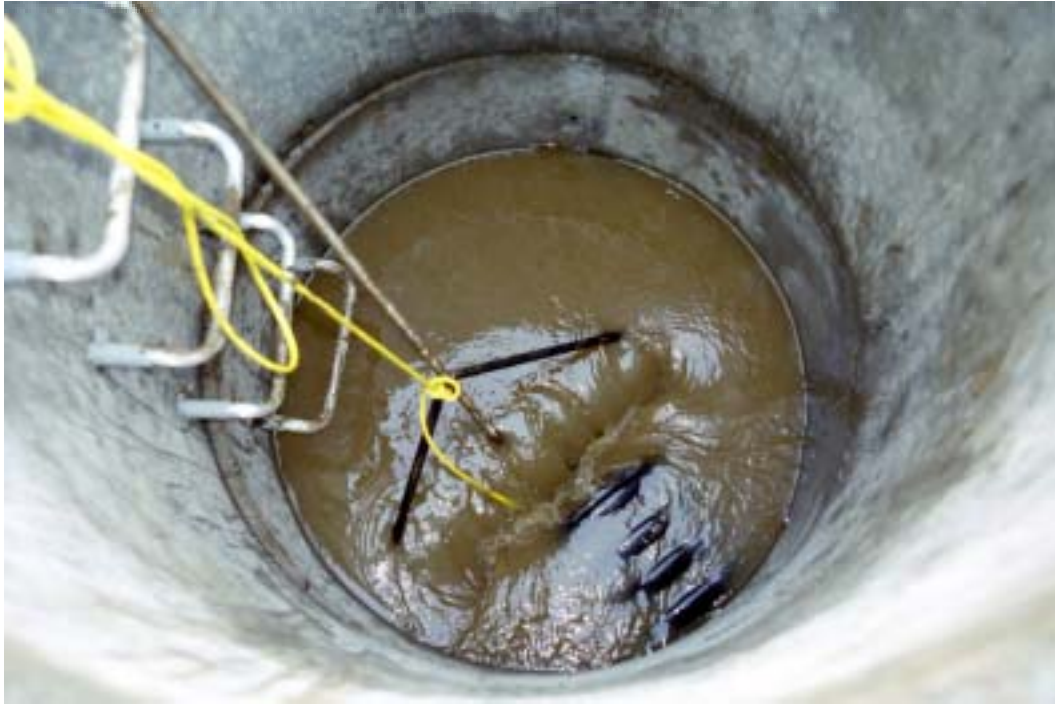
Figure10: The control valve being lowered over the end of the pipe during construction.