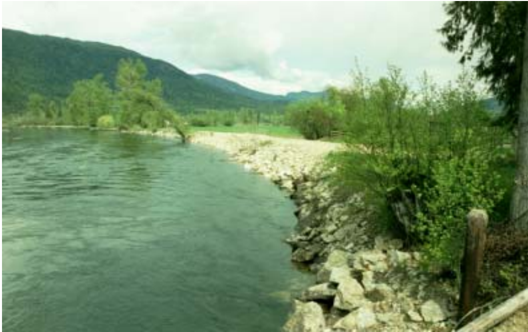
Figure 16: The existing riprap along Lawrence Road had been placed at a steep angle and had been deteriorating. Sixty meters of the road was pulled back 2m from the river to allow new rock to be placed at a more stable angle. Willow stakes were planted in with the rock. Work was done outside the window and without working in the water.

to widen the road prism and eight loads of crushed gravel were used to surface the road. Willow cuttings were planted during the placement of the riprap.