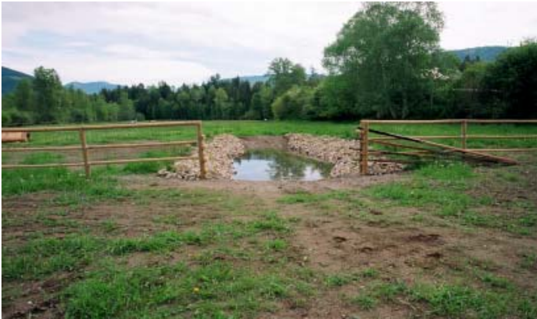
Figure 8: This water jump was dug 30m from the pond. It is connected to the pond by a 20 cm pipe that supplies water to the jump.

The Hahn property is an equestrian center and the pipeline and pond are located in fields used for jumping. The landowner had hoped that he would be able to use the open channel in the original plans in his jumping course. This wasn't possible with the buried pipeline. To allow him a water jump, a 25 cm pipe was connected to the 600 mm pipe that diverts water to a water jump and then back to the sediment pond. The jump area is a 5 m x 15 m trench 1.5 m deep at the center tapering to ground level at the ends. Two sides are steeply slope and rocked while the north and south ends are low gradient to allow the horses to run through (Figure 8). There is 30 cm of water on the graveled bottom. The jump is located 30 m up the pipeline from sediment pond.