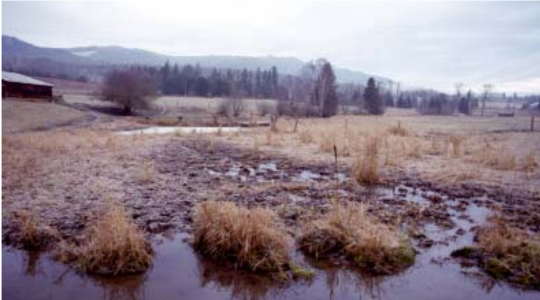
Figure 26a: Cattle have trampled this feeder creek to the Procter Channel to the point that there was no defined channel and vehicle access to the field was not possible except in very dry weather.

crossings and around the barnyard. The combination of the new fence and restricting the cattle from trampling a small intermittent stream that flows through the yard, greatly improved the appearance of the property (Figures 26 a & b).