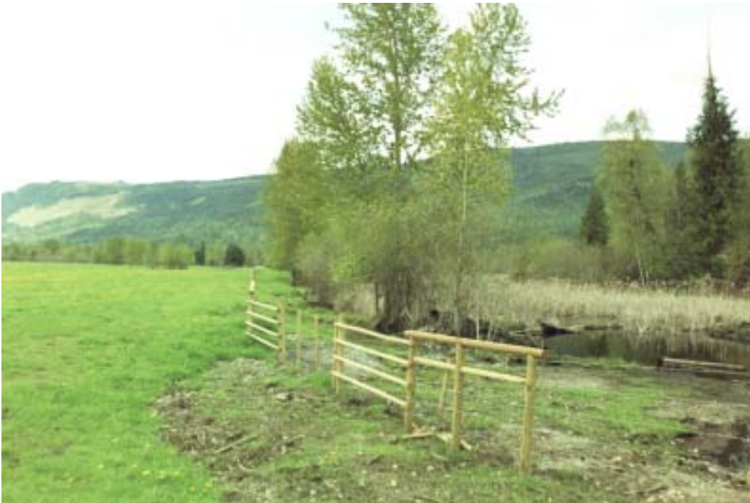
Figure 23: The braces shown above were placed wide enough apart to allow a wire gate to be placed in between. In addition to the gate, sections of rails were also used. The rails offer strength at a point of concentration if cattle have to be moved through and a climb-over for quick access into the riparian enclosure.

The gap between the two braces is most often spaced about a meter with three or four rails joining the two braces. The rails make a convenient climb-over and don't translate lateral tension. In some cases, a larger gap is left and a gate place between the braces (Figure 23).