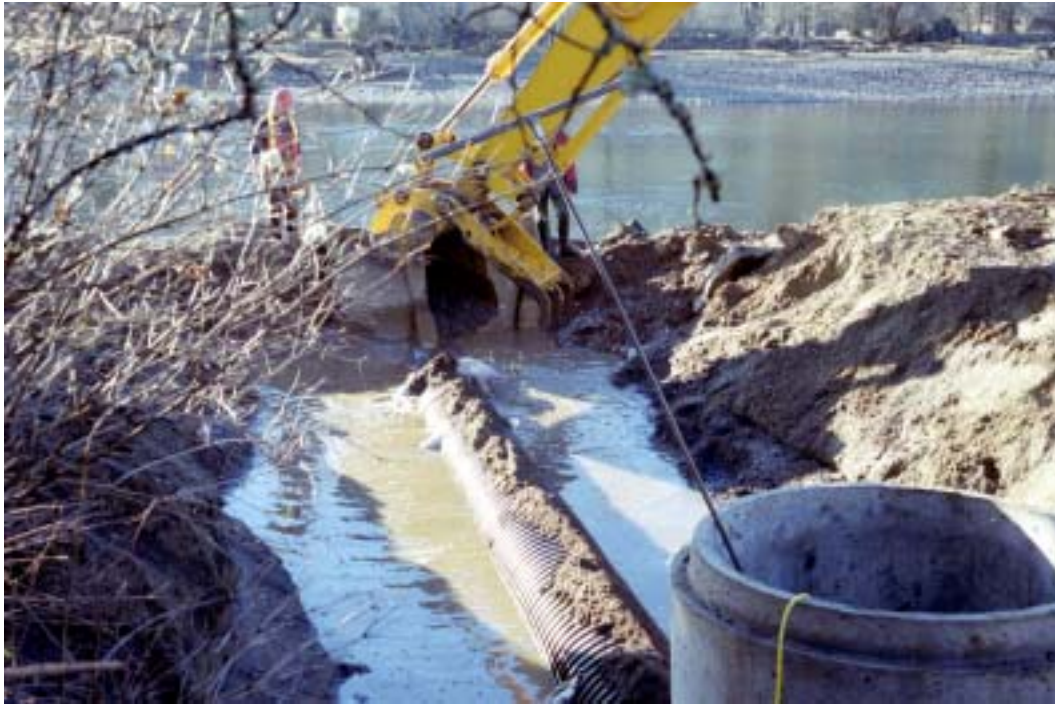
Figure 15: With the last section of pipe in place, the water was not able to drain down the pipeline to the sediment pond. Much of the water could be bailed from the ditch to the field side of the road, but there still remained enough moisture in the backfill to make vibration ineffective. A load of rock was added to the fill to give support until the material was able to drain.

rock had to be added to the road prism. The road was topped with a layer of crush material and compacted.