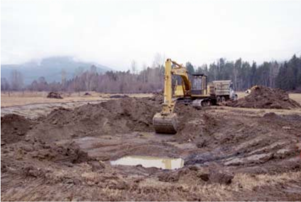
Figure 3: The settling pond located on the Hahn Property. Waste material was used to fill low spots on the adjacent fields while gravel was used for spawning areas.

(Figure 3). Because of the fine material at the ground water level, the depth of the pond was limited to about 2 m at the widest sections. Trying to dig deeper just resulted in the sides sloughing in and the pond widening. The intake is at the south end and the outlet on the north end. Spawning gravel has been placed at the inlet, the narrow center and the outlet.