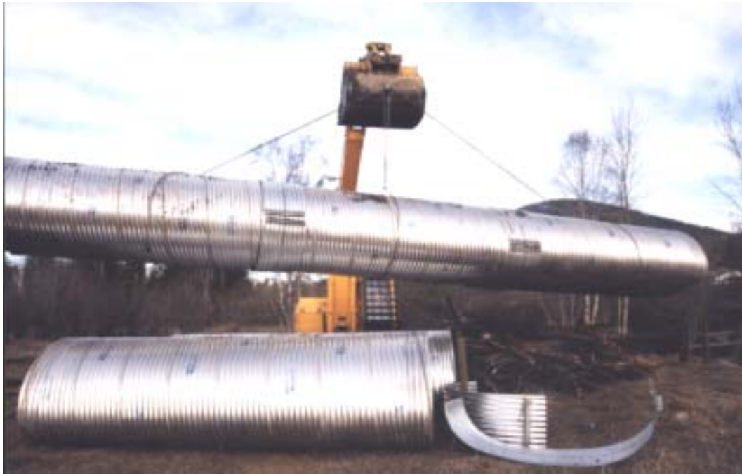
Figure 17: The JD 790 lifts a 2130mm x 1400mm x 12m steel pipe arch to placed it at a channel crossing. The culverts were assembled on the flat and lowered into place. The unseasonably dry weather allowed this work to be done in the dry.

mm x 970 mm pipe was used at the uppermost crossing. For crossing farther downstream on the channel either two 1390 mm x 970 mm pipes or a single 2130 x 1400 mm was used to accommodate the additional groundwater flow. The single larger pipe arch would be preferable because there is less chance of plugging with debris or being dammed by beaver. However, on some crossings the surrounding fields are only slightly higher than the water level. To build the road high enough to accommodate the larger culvert would make the crossing higher than the adjoining fields. During flood periods this would force the water to flow through the fields instead of over the armoured crossing.