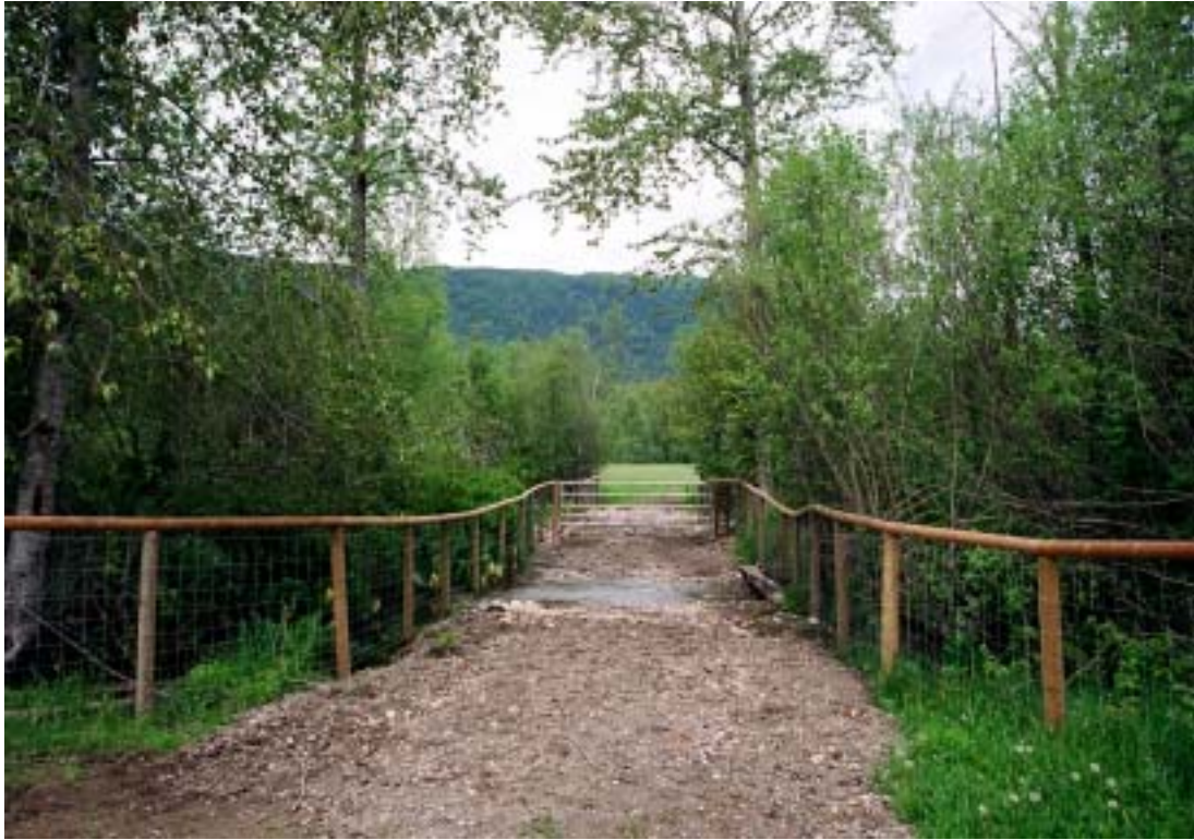
Figure 18: The middle crossing on the Affolter property doubles as an armoured watering site. With the gate in the center closed, animals can access the water from either side of the crossing. With the gate open, the channel can be crossed. A layer of rock was topped with a layer of gravel to prevent sedimentation of the channel.