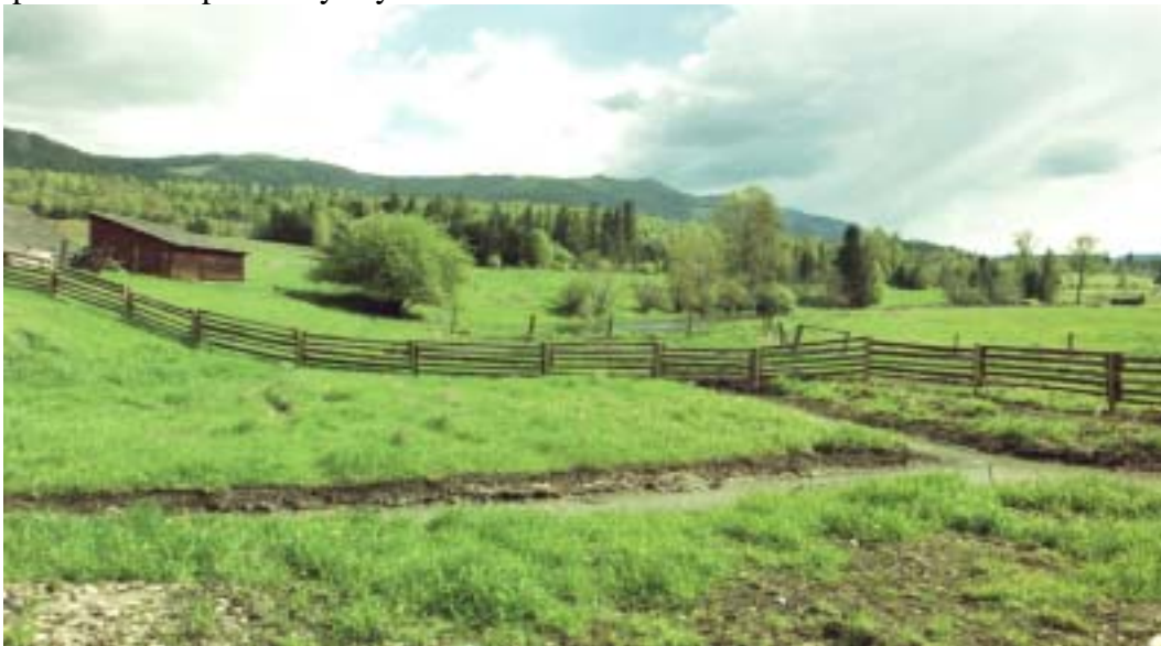
Figure 26b: The creek has been redefined, a culvert placed and an enclosure fence of salvaged cedar rails has greatly improved the appearance of this property.