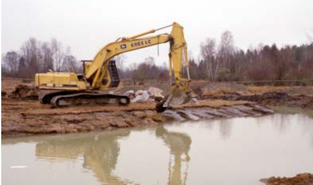
Figure 4: The sod was replaced along the sloped edges of the settling pond. Shrubs and trees were planted in the spring.