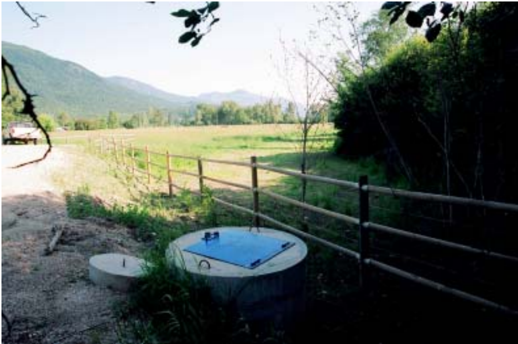
Figure 9: The manhole housing the control valve is located on the north shoulder of Lawrence Road. The metal door is locked.

The manhole consists of 3 – 1 m high concrete rings 107 cm (42”) in diameter. The bottom ring has an 8 cm concrete slab at the bottom. The top ring has a concrete lid with a lockable metal hatch. The valve is a simple steel plate with sides that allow it to slide over the last rib of the pipe (Figure 10). It is lifted and lowered manually with a handle welded to the back of the plate. It can be held open by a chain at 5 cm intervals (the length of a link). The concrete rings are fitted with rungs for access to the bottom of the manhole. If work has do be done on the valve, the water can be shut off at the intake structure by sliding a half sheet of plywood between the concrete and the grill.