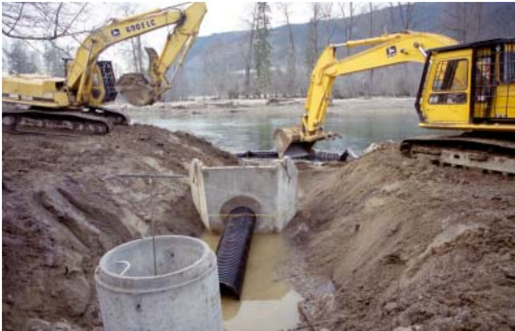
Figure 13: A silt fence was placed in the river. The intake structure had a 3 m piece of pipe attached to it. The last section pipe to be installed connected the intake structure pipe to the manhole. This allowed about 30 cm of leeway.

The pipe had previously been laid up to the manhole and backfilled before the road was breached. A 3 m piece of pipe had been fitted to the intake structure (Figure 13), so that once the structure was in place, only one section of pipe placed to complete the line.