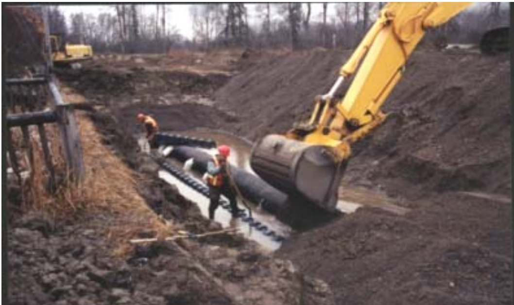
Figure 6: An infiltration gallery was placed beside the 600 mm pipe to collect groundwater. This will allow a flow of water even when the intake is closed. Sandbags were used to counter the buoyancy of the pipe.