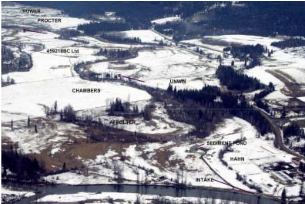
Figure 1: The photo shows an overview of the Procter channel looking north. From the intake on the Shuswap River (bottom right) there is 300 m of buried pipe diverting water to the sediment pond. From the sediment pond, the water flows into existing channels and wetlands. Photo taken Feb 2003.

At a later meeting the landowners were asked if they had any preferences to what the channel would be called. DFO and WCRC had originally referred to it as the Bigg Channel because the early plans considered using water from Bigg Creek to supply the channel rather than diverting water from the Shuswap River. (There was inadequate summertime flow.) The landowners voted to name it the Procter Channel after the family that homesteaded the Mabel Lake valley.