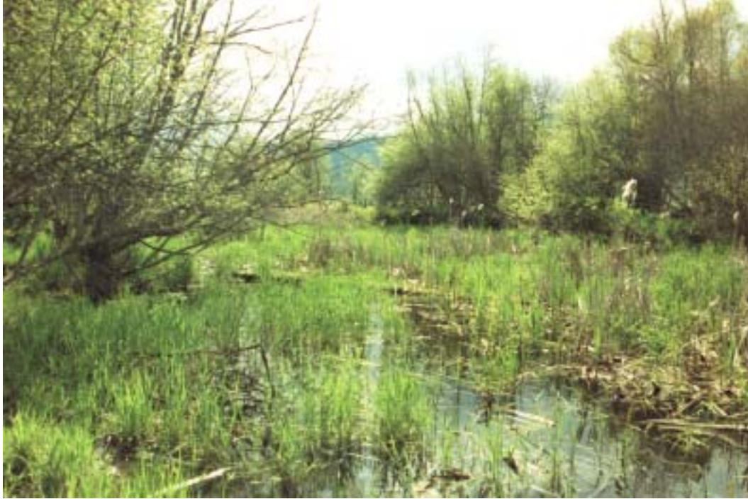
Figure 2b: The wood debris left from land clearing becomes fish habitat when water is added to the remnant channel. Photo taken in May 2003.

The intake structure is located 70 m downstream of the Bailey bridge on the right (north) bank of the river on Lawrence Road (off of Mabel Lake Road). The bank is a heavily riprapped downstream of the bridge for over 100 m. Bigg Creek enters the Shuswap 20 m upstream of the bridge.