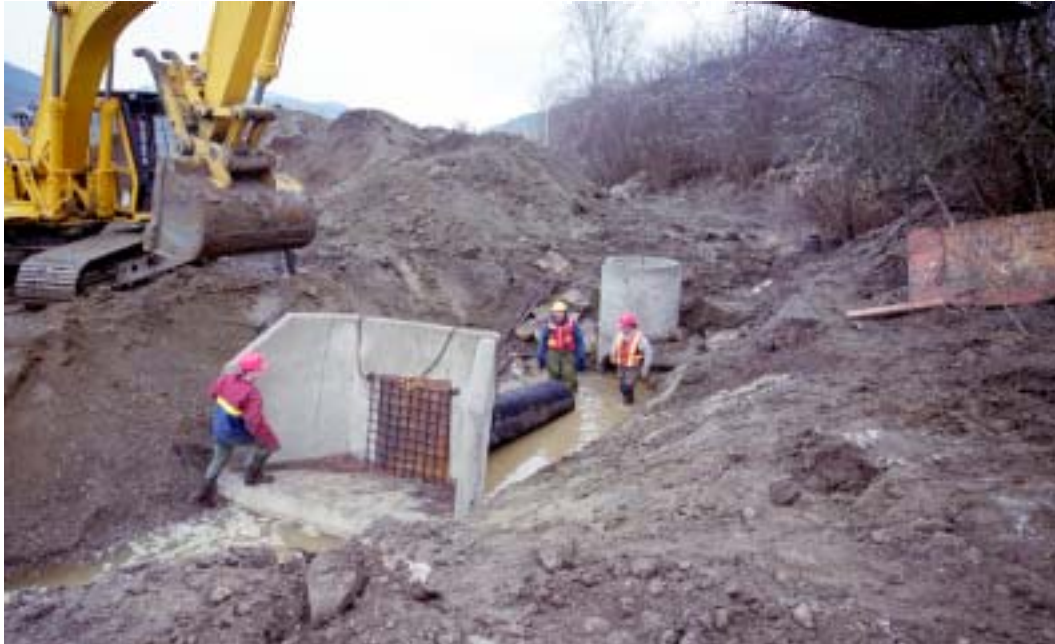
Figure 12: The inside grill of the intake structure is fixed to the concrete for safety reasons it can only be removed with a cutting torch. A piece of plywood is blocking the pipe.