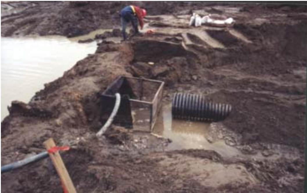
Figure 7: A pump was placed behind a berm on the downstream end of the intake pipe. This allowed the ditch to be drained for ease of pipe placement and minimum sedimentation.

The outlet of the pipe was kept separate from the rest of the sediment pond with a berm (Figure 7). A sump hole was dug at the downstream end of the pipe, separated from the pond by a berm. A wire cage was placed in the sump hole and water pumped from the caged area to the sediment pond, keeping the ditch line water level to a below 30 cm. The cage kept the pumps from being clogged from wood debris flushed out while excavating. While the pumps were running, the ditch water 0.6 to 1 m below the pond water level. Over night, the pumps would be shut off and the berm breached slightly. By morning, the ditch water would have risen and would be flowing into the pond through the breach. An hour before work was to begin, the breach would be filled and the pumps started.