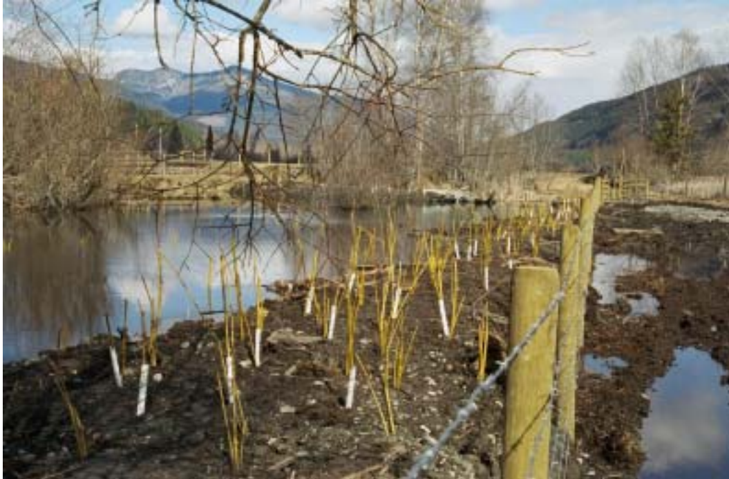
Figure 19: When the above refuge pond was dug, the soil was placed along side the channel and heavily planted with Pacific willow before the soil froze. Later in the spring rooted stock was also planted.

Because willows are so quick to grow, it is hoped that by planting the disturbed areas heavily they will out compete invasive weeds.