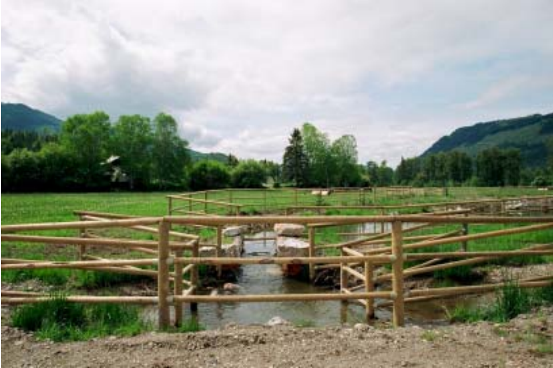
Figure 20: A rail fence was built on the Hahn property to match the existing fence. Plastic cups are used to attach the rail to the post to lessen the chance of injury to the horse or rider. Holes are drilled through the post and electric wires are run between the rails.

Both the Affolter and Unwin properties were fenced with page wire with a top rail. Page wire was requested because the landowners anticipated keeping sheep in the fields adjoining the channel. One of the difficulties using page wire is that it acts as a barrier to most wildlife. Larger deer can jump the fence but fawns will look for a way under the fence often making them susceptible to predation. Bear will struggle with the fence, eventually pulling it down trying to get through or over it. In an attempt to remedy this, rails located 35 cm and 90 cm above the ground were placed on some sections of the fence. The bottom of the page wire was cut and lifted to the bottom rail and the top of the page wire was cut and lowered to the top rail to allow limited passage under and over the fence at these sections (Figure 21). These sections were placed where game trails were evident during the winter. An additional one was added in June where there were signs of animals trying to pass through the unaltered fence. These railed sections double as climb-overs for human access into the riparian area as well.