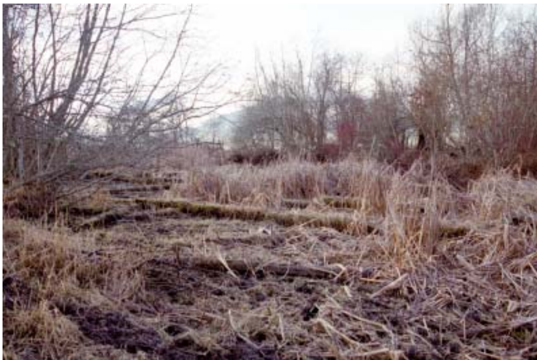
Figures 2a: Trees and roots were often pushed into sloughs when the land was cleared. Photo taken in November 2002

The land adjacent to these channels is largely agricultural, being used for pasture and hay production. The existing riparian width along the old channel varies from 20 m to over 120 m. The riparian is largely deciduous, the merchantable timber having been removed. The old channels are richly complexed with woody debris due to the old clearing practices. When the adjacent fields were being cleared, the stumps and unusable logs were pushed into the old channels both to dispose of the waste and create fill to enlarge the fields. Much of the cedar roots and logs still are present and provide in-stream cover (Figures 2a & b).