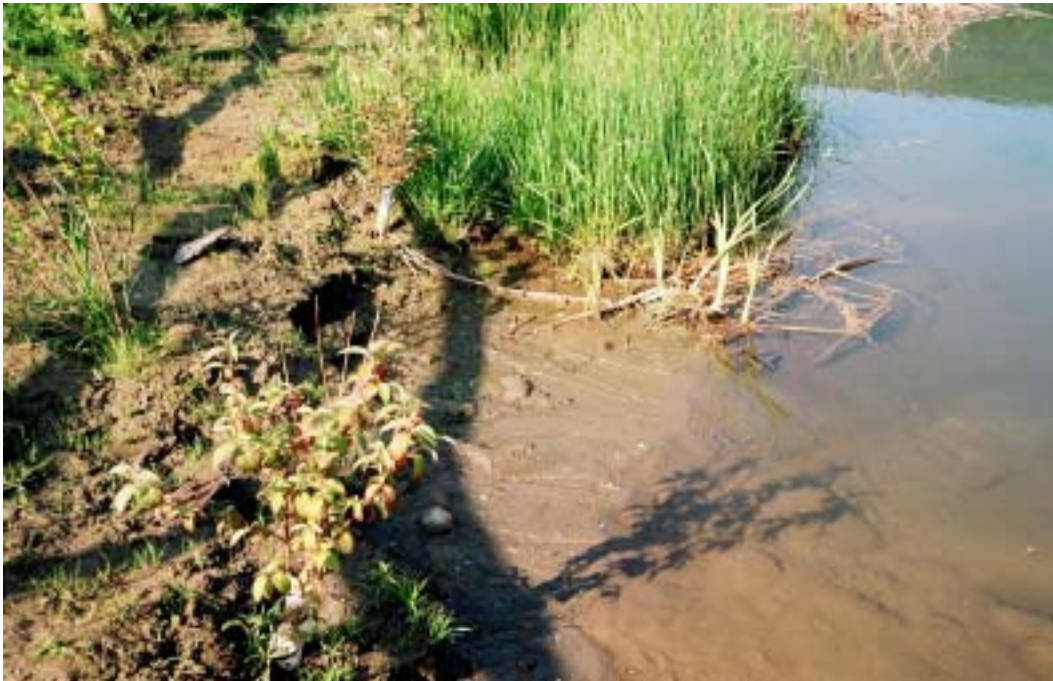
Figure 25: This photo shows a spot of the pond shore where there was no sod placement. Groundwater is seeping in, eroding the silty soil. In the upper half of the photo, the sod is established and prevents this erosion.

have the pipe buried through his property plus there was heavy traffic through his property by pickups and machinery that trampled other fields during construction. In return, he got a pond that is well planted and improves on the aesthetics of the property. He also got a low spot in his fields filled with the spoil from the sediment pond and he got two riding jumps built. One of the jumps is a narrowing of the channel just upstream of the culvert at the Hahn/Affolter property line (Figure 25). The other is the 4 m x 15 m trench shown in Figure 8, p. 20.