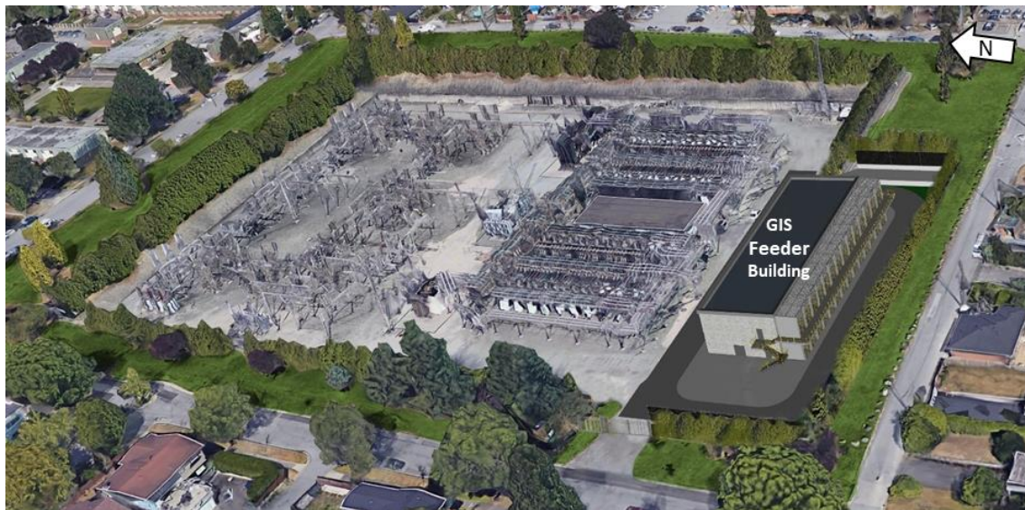
Figure 2 Location of the New Gas Insulated Switchgear Feeder Building