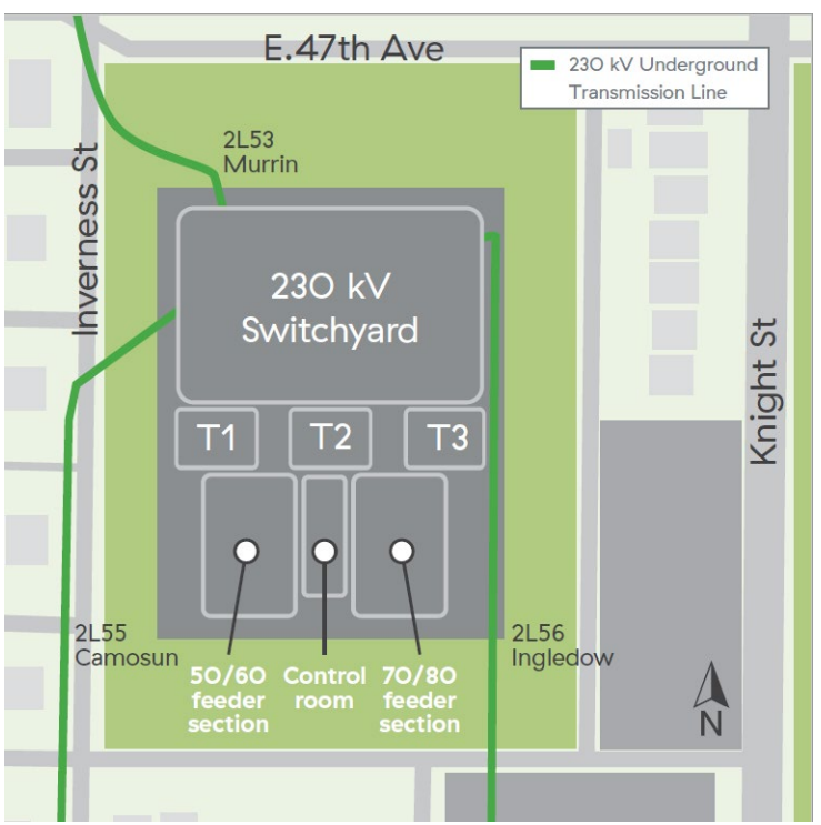
Figure 1 Mainwaring Substation Layout

The Mainwaring substation is centrally located within the Metro Vancouver Burnaby sub-region, which comprises 16 substations. The Metro Vancouver Burnaby sub-region has the largest load in the BC Hydro system. Based on peak demand, the Mainwaring substation is the seventh largest distribution substation in the BC Hydro system. The Mainwaring substation is a high criticality substation with a normalized criticality score of 83/100 (with zero being the least critical and 100 being the most critical substation). The Mainwaring substation layout is shown in Figure 1 below.